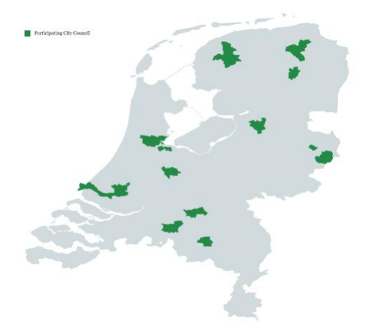
Figure 1: Geographical dispersion of local governments in this study

concluding questions. For weighing the six factors, we adopted a point allocation method from multi-criteria decision making (MCDM) research, specifically by letting interviewees divide 100 points across the six factors (Bottomley et al., 2000; Mukhametzyanov, 2021). MCDM methods have been used previously in transport policy research as reviewed by Gohari et al. (2022). Our point allocation method is easy to understand for interviewees and forces them to consider trade-offs in the relative importance across all six factors (Zardari et al., 2015). The other elements of the interview were aimed at elaborating on how the points were allocated and how the city deals with requests for parcel locker placement generally.