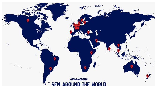
Figure 1 Geographical locations of the contributors to the blog series 'Sport and Exercise Medicine (SEM) Around the World'.

recognised for having high-quality healthcare systems, such as Belgium, Canada, France, Germany, Sweden and Switzerland, have not yet adopted the stand-alone SEM specialty model. Consequently, young physicians desiring to pursue a career in SEM must combine full clinical training in another specialty before additional training in SEM. However, such additional training is often insufficient to reach the level of expertise encountered in other medical specialties. 4