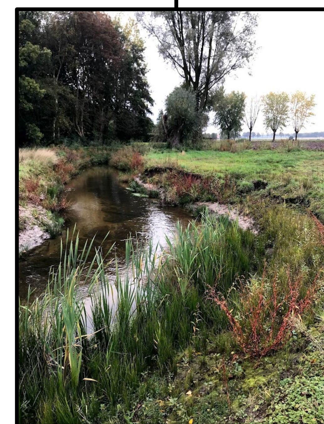
Photos: Co-Adapt field visits