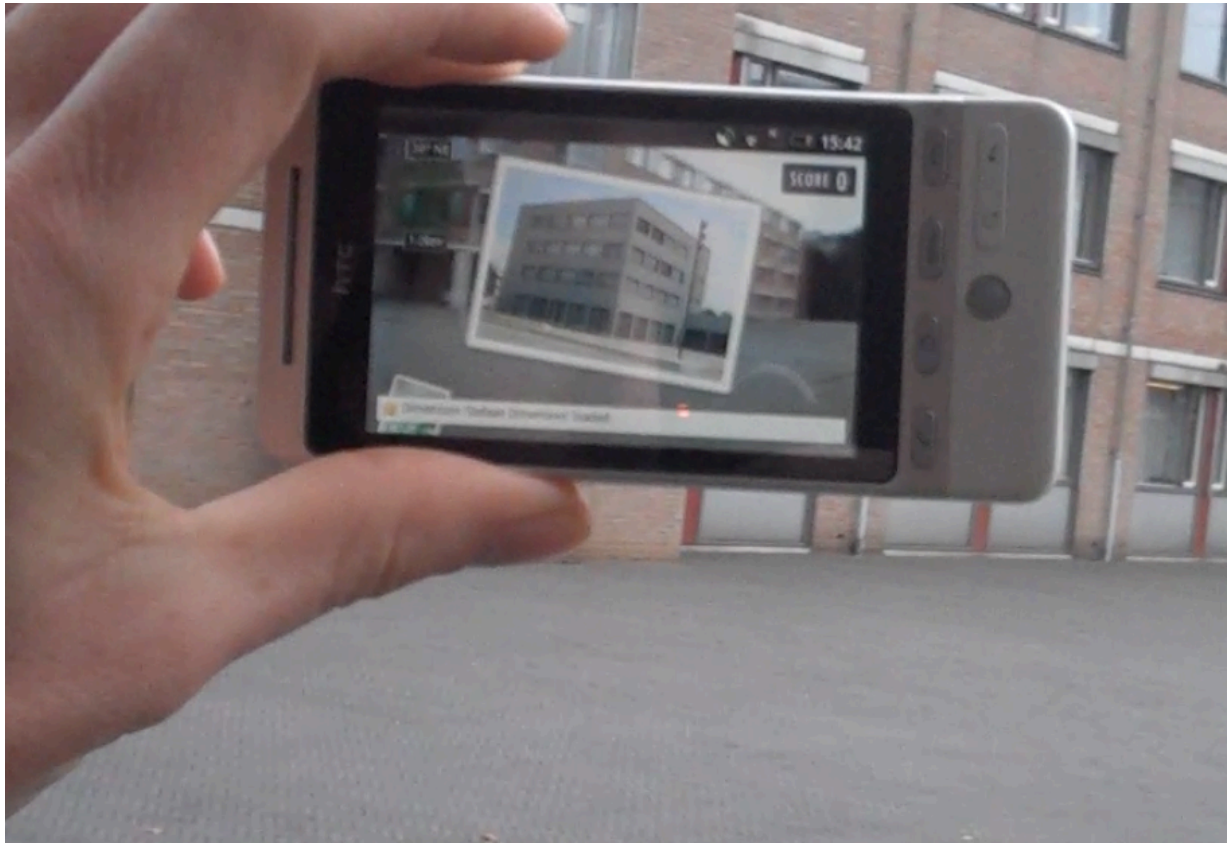
Figure 2: flipping a card