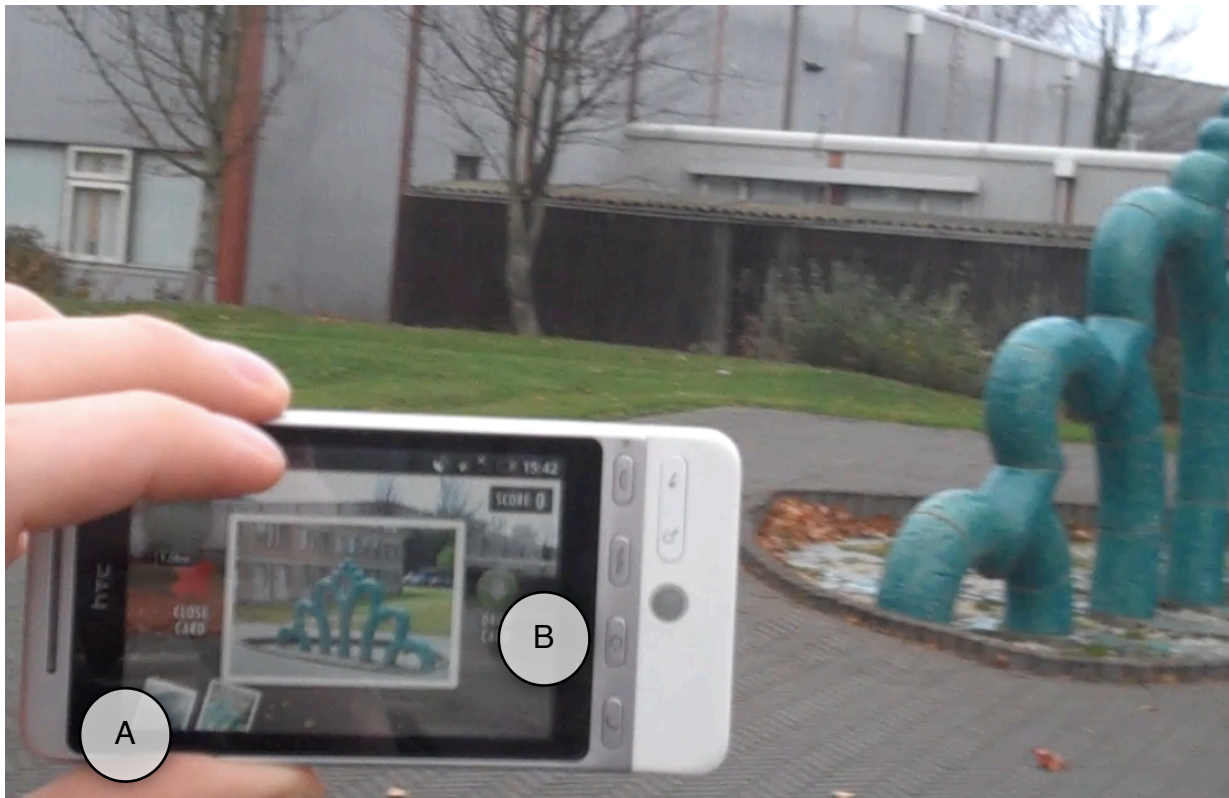
Figure 3: Dropping a (taken) card takes two actions. Action A: select a card from the bag-pack. Action B: clicking the drop button, drops the card on the location.