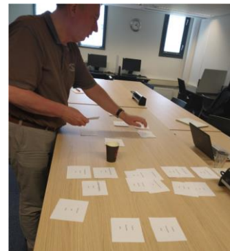
Figure 2 Card sorting

For data extraction, all MMs were extracted from the selected articles. The capabilities were registered, resulting in a list of 127 capabilities. In 2019, we held the Metaplan session together with the three authors of this article while executing the protocol steps, see figure 2 Card sorting .