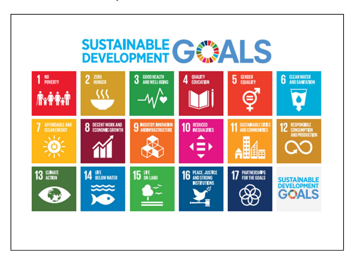
The 17 Sustainable Development Goals

Note. The 17 SDGs developed in 2015 are a blueprint to achieve a better and more sustainable future for all people and the world by 2030. Found (Copyright © United Nations, 2022). <u>http://sdgs.un.org/goals</u>