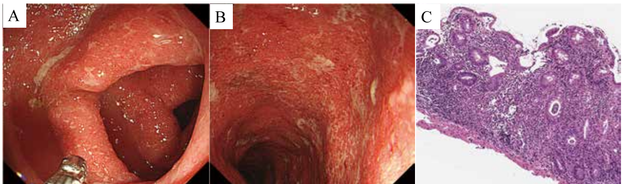
Figure 2. Colonoscopy

Swelling of the submucosal layer from the ascending colon to the sigmoid colon is observed. The diameter of the intestinal wall ( \leftrightarrow ) is 7.3 mm (ascending colon) and 6.0 mm (sigmoid colon).