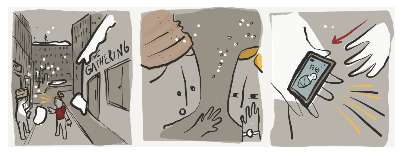
Figure 2: Second part of the scenario storyboard generated from the Prologue section.

to D&D because of the specifics of its model of representing the world.