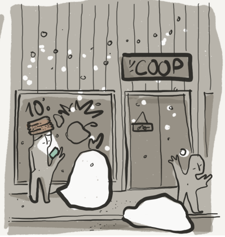
Figure 1: First part of the scenario storyboard generated from the Prologue section. By using TTRPG techniques we can create and craft believable narratives that help us to both explore problems and potential solutions.