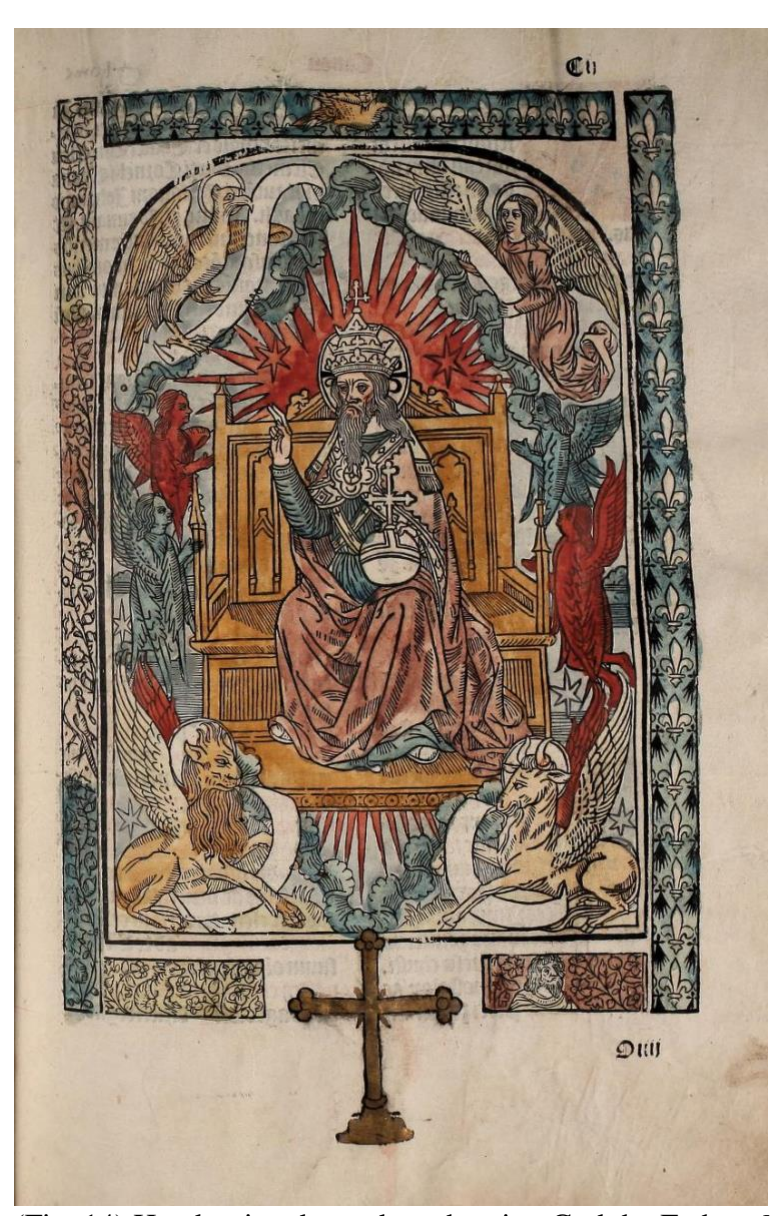
(Fig. 14) Hand-painted woodcut showing God the Father. Missale Saresbueriense (Salisbury), sive Missale secundum Sarum (Rouen: Martin Morin, 1497), ESTC no. s113344, STC no 16171.