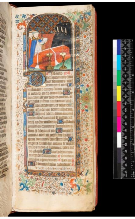
(Fig. 4) Fitzwilliam Museum, MS 40-1950. Book of hours belonging John Talbot, Earl of Shrewsbury, fol. 83r.