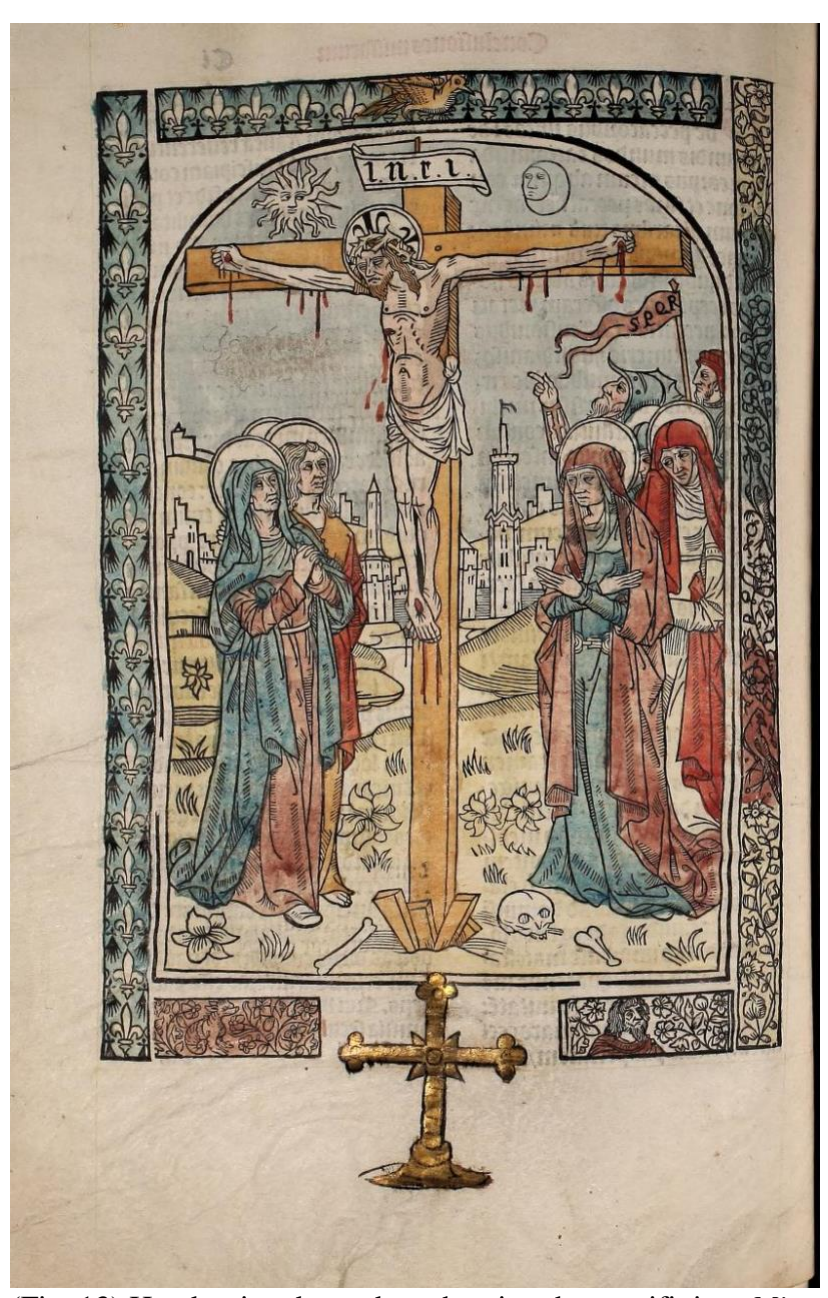
(Fig. 13) Hand-painted woodcut showing the crucifixion. Missale Saresbueriense ( Salisbury ), sive Missale secundum Sarum (Rouen: Martin Morin, 1497), ESTC no. s113344, STC no 16171.