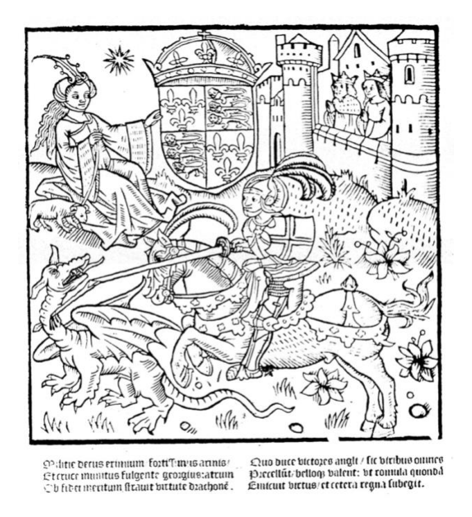
(Fig. 11) Back page of Sarum missal, Missale s[e]c[un]d[u]m vsum insignis ecclesie Sa[rum] , (London: Wolfgang Hopyl, 1511), ESTC 16182a.