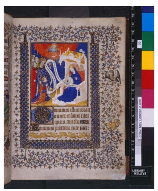
(Fig. 1) British Library, BL, MS Cotton, Domitian A XVII, Fol. 50r. Portraits of the young King Henry VI with the overpainted royal arms of England praying before the Virgin and Child.