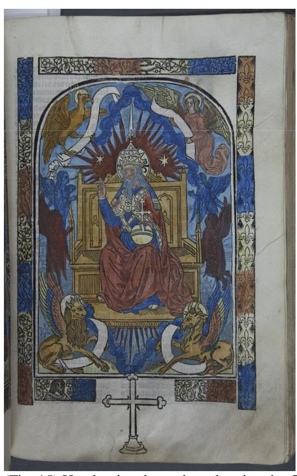
(Fig. 15) Hand-painted woodcut showing the God the Father. Missale secundu[m] vsum insignis ecclesiae Sa[rum. (Rouen: Martin Morin, 1510), ESTC no. 16187.