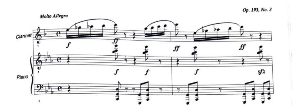
Figure 12: MM 1-2 of "Femme Furieuse" from Three Faces of Woman

Despite including a hint towards a madwoman persona in the opening of the final movement, Shaffer embarks onto a new form in the reappearance of the themes and tropes of the Fatale, Fragile, and Furieuse. Shortly after the third iteration of the Furiuese theme in measure 3, as shown in Figure 13, a quotation of the Fragile theme is present. Reappearing in a duplesubdivided time signature, the Fragile theme is elongated, and the end of the motif ends in minor. The quick pace in which the Fragile theme resurfaces after the initial Furiuese statement is much more than just a passing reflection, and this is supported by the role the accompaniment plays. In the opening iterations of the Furiuese idea, the piano part in Figure 13 can be seen emphasizing the arrival of the clarinet on beat 2 and providing an anacrusis for the final beat of the measure. Following this unison rhythm with the clarinet and accompaniment, the clarinet enters with a variant of the Fragile theme and the accompaniment launches into sixteenth-note figures underneath. The effect of the clarinet soaring over this rhythmic activity provides depth to theme and represents the tumultuous role the Fragile plays from the movement past. With the left hand in the piano providing two sixteenth notes simultaneously with the note in the melody of the shortest duration recalls the pulse of the Femme Fragile idea. The piano not only supports the