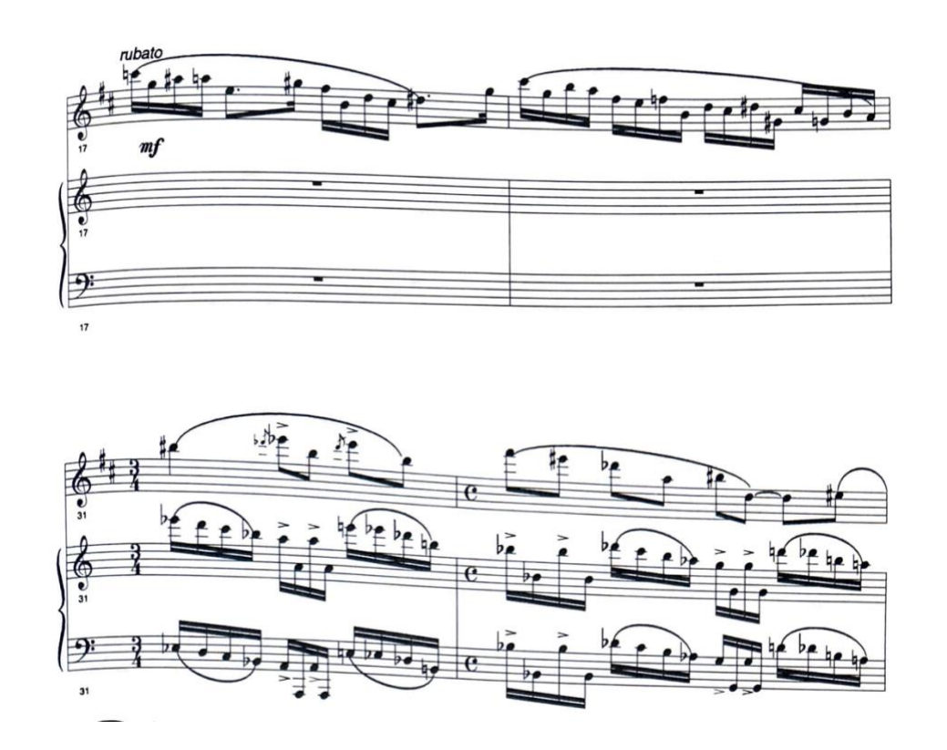
Figure 14: MM 17-18, 31-32 of "Feministe Furieuse" from Three Faces of Woman