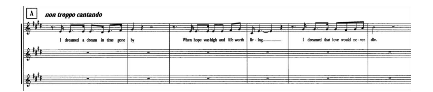
Figure 10: Opening of Fantine's vocals in I Dreamed a Dream

While the berceuse form is most commonly notated in a 6/8 meter, Shaffer's use of the 7/8 meter in the lullaby form not only creates an unequal division of beats, but the "extra" eighth note beat division allows a multipurpose tool for phrasing and creating the character of the movement Dotted rhythms are often used to create energy, for example the "Scotch Snap" of a sixteenth note on the strong beat followed by a dotted eighth note, which would potentially undermine the tone of a lullaby or a lament. <sup>23</sup> While the dotted eighth-sixteenth rhythmic motif does provide motion, Shaffer uses it to further exemplify the trope to propel the longing and sorrow that the Femme Fragile experiences. Fantine continues to work as a prostitute to provide for her daughter she cannot afford to care for, even as it slowly kills her. Micaela continues to love Don Jose and his family unconditionally after discovering his relations with Carmen. The Femme Fragile is a martyr; unyielding in effort for a cause she cannot change. Micaela's musical gesture triplet syncopation and Fantine's dotted eighth sixteenths do provide small bursts of motion, but as a symbol of the pain they are enduring. 1, the rocking rhythm is established in the