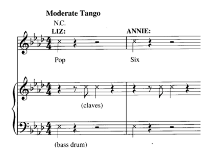
Figure 6: Beginning measures of Cell Block Tango from Chicago – Piano reduction.

Kander, John. Cell Block Tango. Edited by Kander & Ebb. Los Angeles: Unichappel Music Inc.,1975