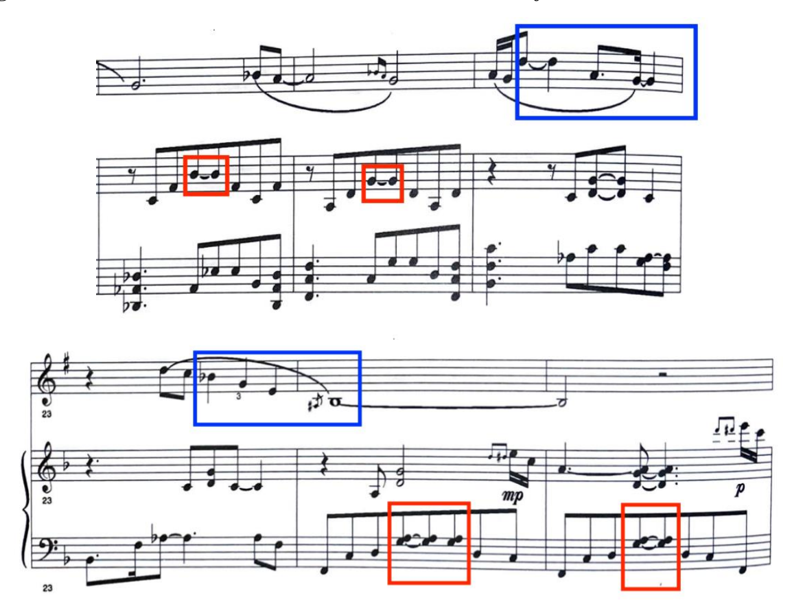
Figure 7: MM 20-25 of "Femme Fatale" from Three Faces of Woman

Kander, John. Cell Block Tango. Edited by Kander & Ebb. Los Angeles: Unichappel Music Inc.,1975