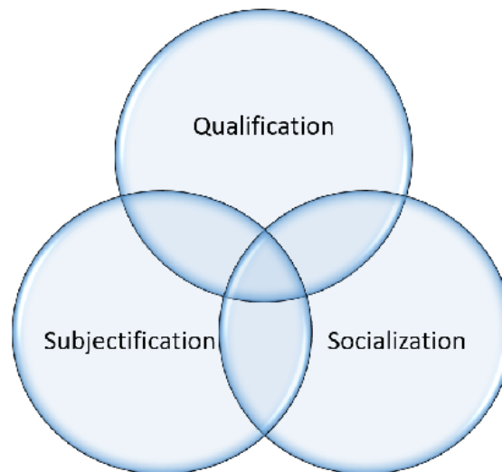
Figure 1. The Education Mandate

For people who fall outside the education and training system, especially adults, it often seems obvious that learning that takes place in the family, among friends or through the media is just as important and relevant as the learning that takes place in formal settings. However, learning that occurs outside the formal education system, for example in the workplace, is not necessarily assigned the same value as that which takes place within formal educational institutions. Much of the research on learning therefore concentrates on learning outcomes through formal education and training, rather than looking at learning as something that happens in different situations and phases in life and in society, such as in prison. In its report, the Organisation for Economic Co-operation and Development (OECD, 2005; 2019) tries to develop strategies in order to use all the skills, knowledge and competencies people develop wherever they come from. This is more necessary than ever in a rapidly changing world.