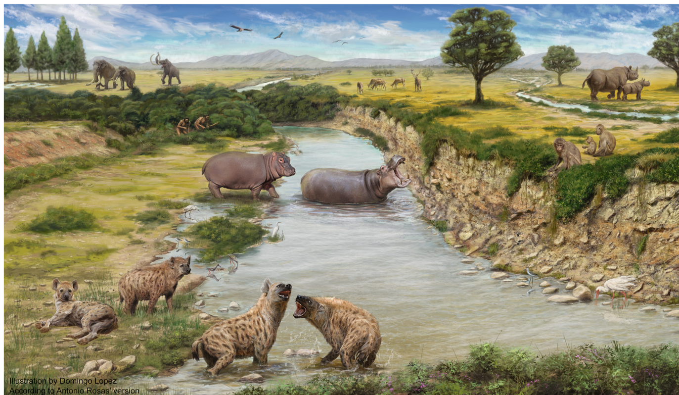
Figure 4. Paleoartistic reconstruction of the environment of Barranc de la Boella (Francolí Basin, NE Iberia) in the Early Pleistocene, highlighting the presence of Macaca sylvanus in the ecosystem. Illustration by Domingo López González, under the supervision of A.R.

fossils are concerned, its measurements and proportions are close to those published for the PA11139 specimen from the Middle Pleistocene site of Quecchia quarry (Bona et al., 2016). The MD measurement of the BB specimen distances it from the proportions of the specimens from the Quibas site, the closest geographically and chronologically to BB (Alba et al., 2011; Fig. 3 and SOM Table S2). In terms of buccolingual compression (BL/MD index, 72%), the data from BB are consistent with some specimens of extant M. sylvanus and close to the proportions of the Quecchia quarry specimens, although the biometric range observed for M. sylvanus pliocena Owen, 1846 and M. s. florentina is practically the same (SOM Table S2).