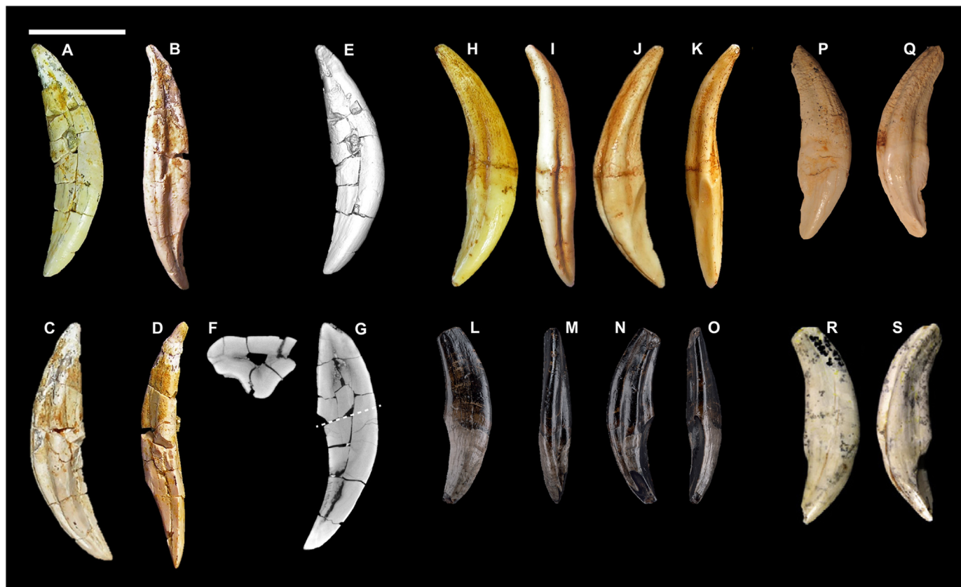
Figure 2. Upper canines of Macaca sylvanus males. A–D) Specimen BB'13C2IIZ.1302 from La Mina site. E) BB'13C2IIZ.1302 microtomographic buccal view. F) BB'13C2IIZ.1302 microtomographic axial plane (slice) at the root-enamel junction. G) BB'13C2IIZ.1302 microtomographic sagittal plane (slice) in the middle of the tooth. H–K) Right C 1 of extant Macaca sylvanus sylvanus cast (UVA3358, cast). L–O) Mirror image of the left C 1 of M. sylvanus from a possible Late Pleistocene site in the North Sea (HHO-0420; modified from Reumer et al., 2018). P, Q) Right C 1 (MCSNBS PA11138) of M. s. plicifera from the Middle Pleistocene site of Quecchia quarry (modified from Bona et al., 2016). R, S) Mirror image of the left C 1 (MUPE GCP-CV4052) of Macaca sylvanus florentina from the Early Pleistocene site of Quibas (modified from Alba et al., 2011). A, H, L, P, and R: buccal view; B, I, and M: mesial view; C, J, N, Q, and S: lingual view; D, K, and O: distal view. Scale: 2 cm.

The specimen is a characteristically dagger-shaped tooth with an extensive wear facet on its lingual side, a long mesiolingual facet, and a mesial groove extending onto the root that is characteristic of the upper canines of papionin cercopithecoid monkeys (Strasser and Delson, 1987). The size and shape of the tooth, the broadly flat buccal face, the location of the mesial groove on the crown and root, and the location of the wear facets (especially the sharpening facet) rule out its attribution to the genus Theropithecus and fit perfectly