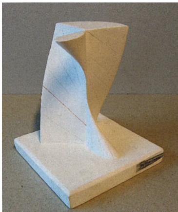
Series VII 23

For K = \mathbb{R} , there are three types of cubic ruled surfaces (omitting cones). The plaster models VII, nr. 20–23 and the string models XVIII, nr. 1– 4, in part I of the Schilling catalogue, represent equations (1) and (2).