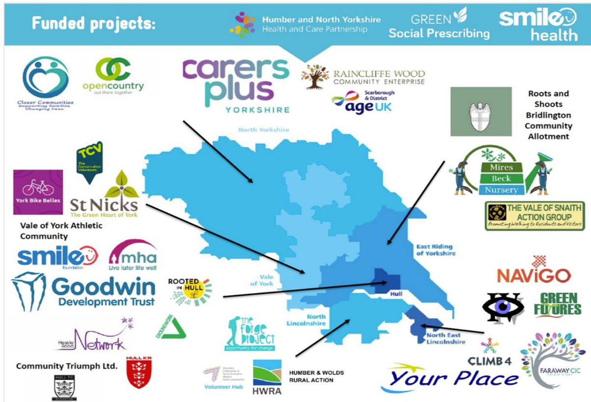
Figure 2: Funded nature-based projects delivered across the six areas of HNY

Nature-based providers were identified by the HNY GSP programme team and shared with the SP/referring services who also utilised existing relationships with provider organisations. In addition to existing nature-based projects being delivered across the HNY region, additional nature-based projects were directly funded by the HNY GSP programme to support the referral of participants into GSP activity.