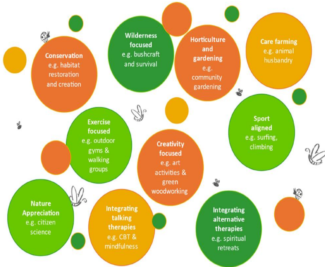
Figure A1: Nature on Prescription Handbook categories for nature-based interventions