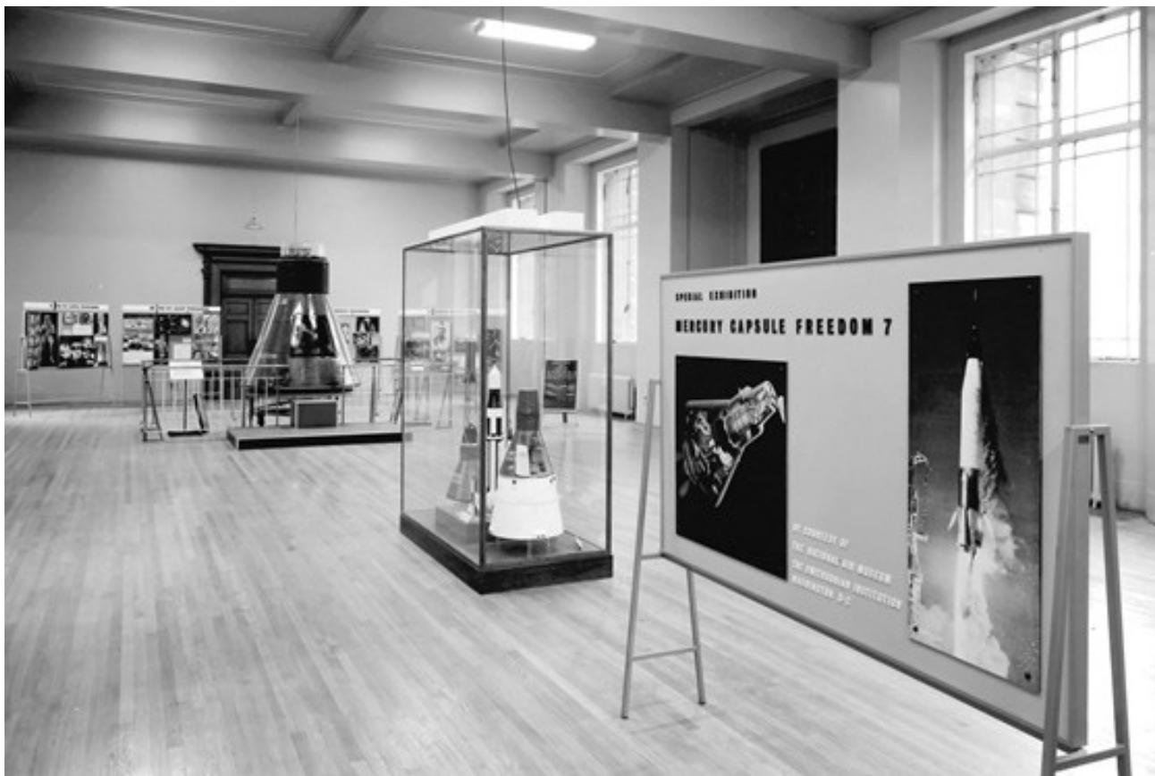
The Space Conquest exhibition at the Science Museum, London, 1965