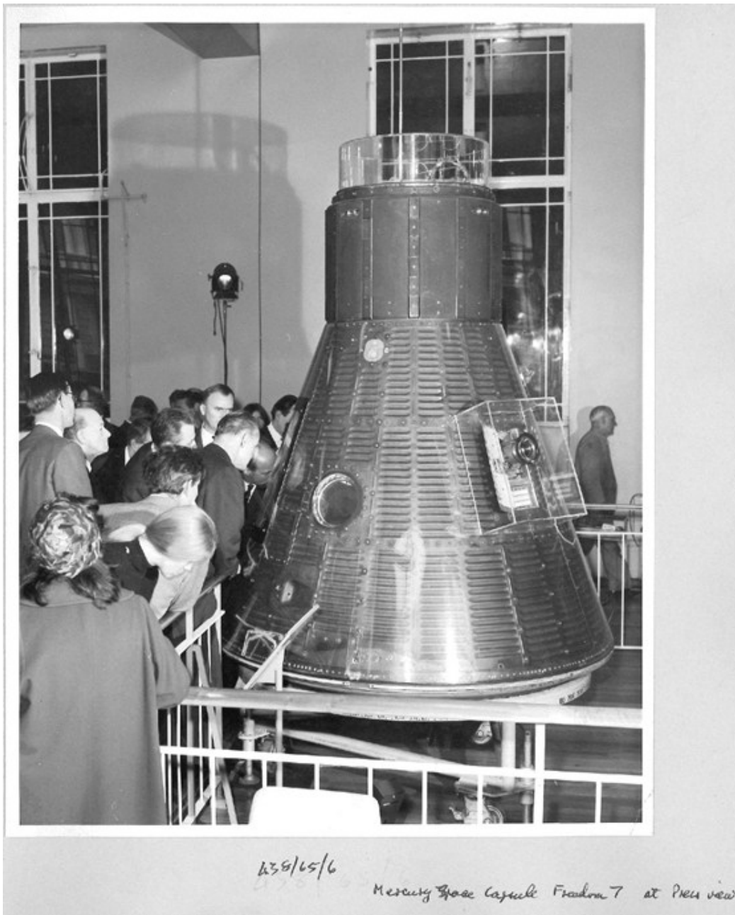
The Freedom 7 space capsule at press viewing, 1965