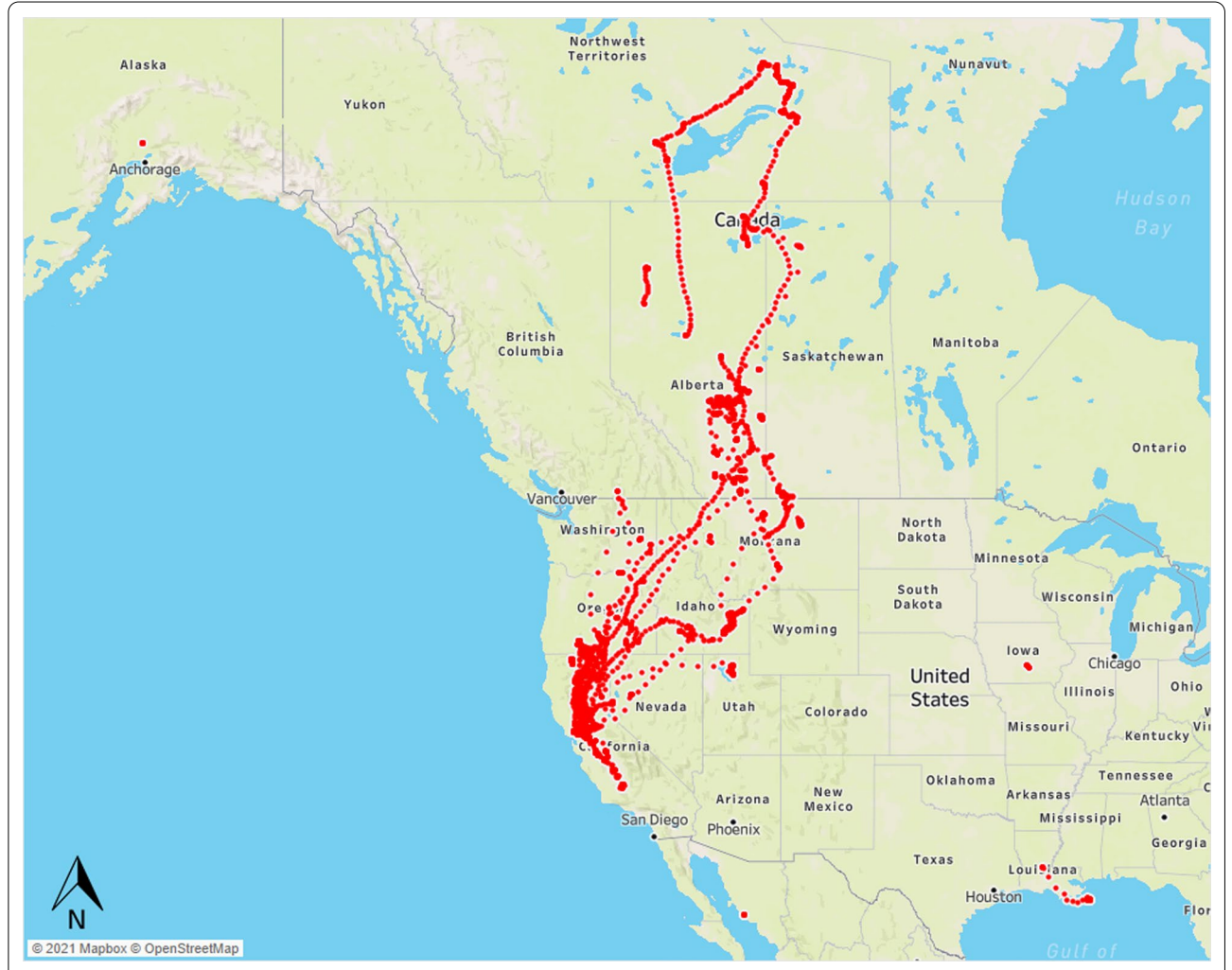
Fig. 1 Extent of 224,016 GPS locations obtained from 131 individual ducks of 5 species and representing 9334 bird-days. Daily sets of hourly location data used to train and validate machine learned classification models for dabbling duck life history states and movement patterns

Annotation was performed on daily sets of 24 hourly GPS locations obtained between January 2015 and August 2020 from 131 free-living waterfowl representing 5 species in North America, includes GPS locations from two undeployed transmitters representing bird mortality