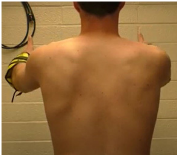
Figure 2a. An example of a right-handed pitcher, who was classified with no scapular dyskinesia on the throwing side (right) whereas the presence of scapular dyskinesia was observed on the non-throwing side (left).