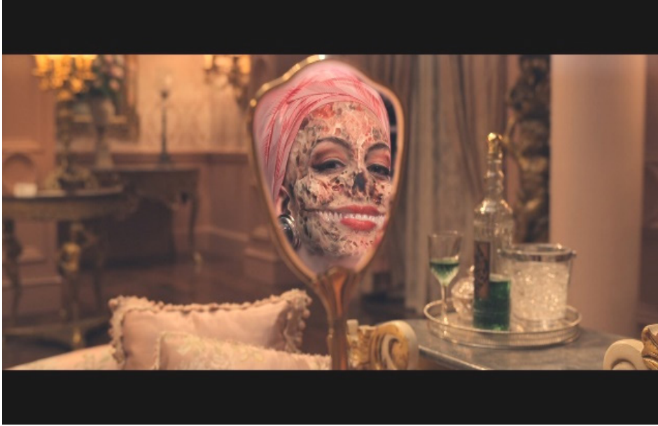
Fig. 4: The Witches (2020), dir. Robert Zemeckis, min. 30.29

mirror, where she reflects and admires it with delight. Her face is full of scars old and new, her nose is missing, her mouth stretches to her ears, revealing a long row of teeth; only her eyes remain unchanged.