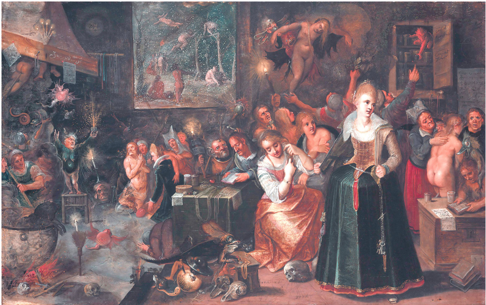
Fig. 2: Frans Francken II, The Witches' Sabbath

The painter Frans Francken II (1581-1642) was very much concerned with witchcraft, to which he dedicated several important paintings which could be grouped into two main categories: those called The Witches' Kitchen (with three slightly different versions) and those usually called The Witches' Sabbath (with three basic versions). The most significant painting for the study of corporeality seems to us to be the one preserved in the Staatsgalerie Neuburg in Bavaria 15 . Here one can find the largest cluster of witches' bodies, in various poses and performing various actions. One is riding a broom and the spectators can only half see her flying through the chimney. Others are brewing filters or potions or reading from forbidden books. In this painting by Frans Francken, the viewers can also identify the biggest accumulation of naked bodies, which allows an analysis of anatomical details. The old witches have masculinized faces or animalistic figures, their postmenopausal bodies