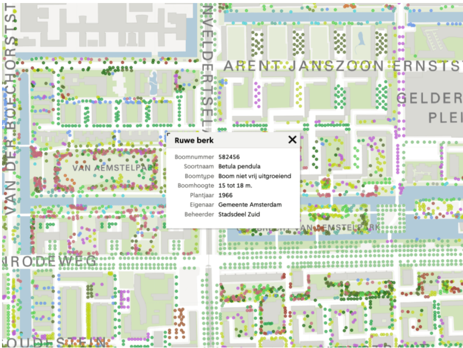
The map “Trees — In Maintenance of the City of Amsterdam”

In their contextualization of the digital image as “softimage,” Ingrid Hoelzl and Remi Marie propose that “the image is no longer a stable representation of the world, but a programmable view of a database that is updated.” 14 The exploration of the role of digital databases in the production of urban nature points to the entanglement between questions of sustainability and technology, care and connectivity. The abstraction of real environments in digital maps could be understood as a similar displacement of caring practices from the immediate and lived to the mediated and distant. In the dual logic of maintenance as care and care as maintenance, the spatial and temporal tensions in the mapping of urban nature become foregrounded.