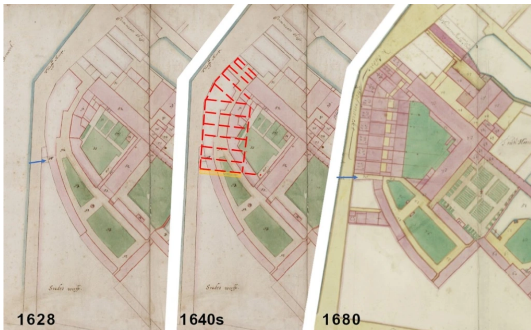
Fig. 3: Comparison between the maps made in 1628 and 1680. In the middle section, the perimeter of Vingboons' houses is roughly superimposed on the map of 1628 to give an idea about the portion of the inner courtyard that was incorporated into the new design and the shifted location of the access to the Gasthuis terrain. (Amsterdam City Archives, 342 Inventaris van het Archief van de Gasthuizen, inv. nrs. 1468 and 1469).