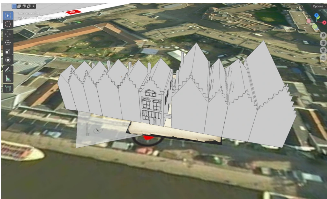
Fig. 6: The schematic 3D reconstruction of Coninxloo's and neighbouring houses resulting from this research and available to download from the Amsterdam Time Machine zenodo community .

As this Coninxloo case has demonstrated, archives are a treasure trove to reconstruct the history of a house, its inhabitants, and its neighbours. Pieces of information to be cross referenced can come from disparate sources, even produced much later than the period in question. This time consuming but rewarding task of researching archival materials over a long period of time helps to shed light on the diachronic urban development and on the people that inhabited these buildings. The schematic, grey-scale 3D reconstruction of Coninxloo's and neighbouring houses (fig. 6) based on the sources discussed in these blog posts and a chronological list of these sources are available to download from the Amsterdam Time Machine zenodo community ( DOI: 10.5281/zenodo.7274567 ).