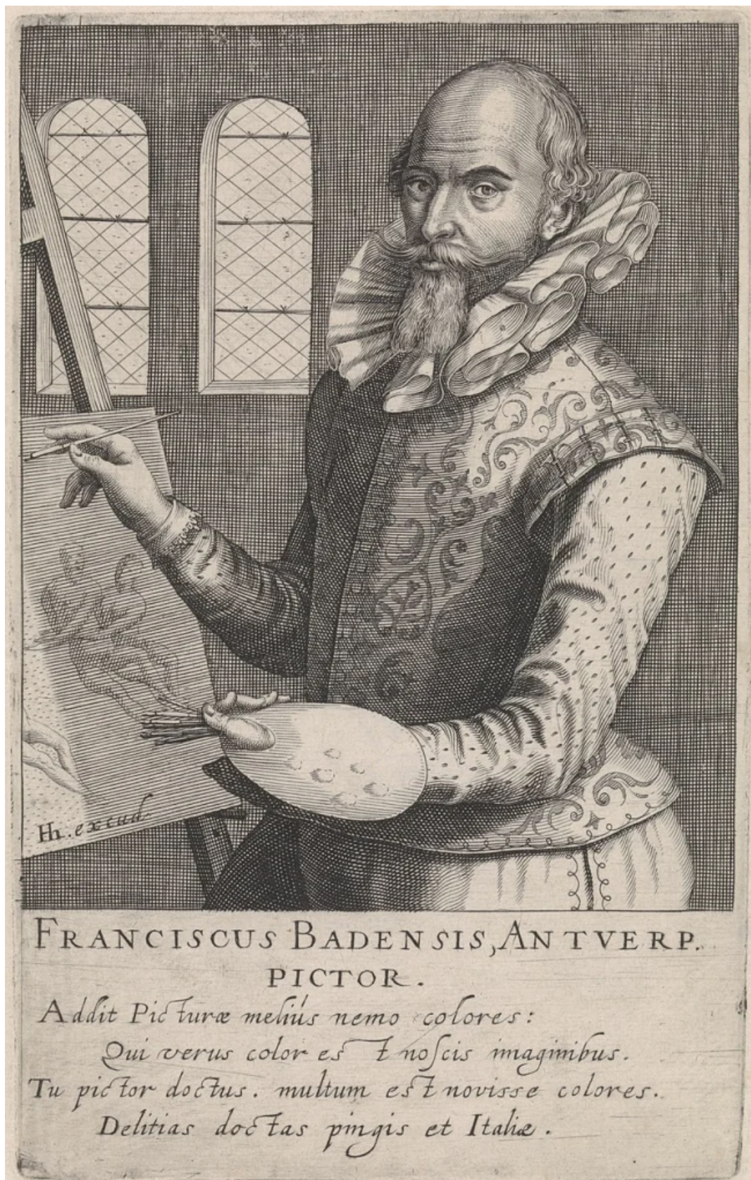
Fig. 1: Frans Badens in the Pictorum Aliquot Celebrum Praecipuae Germaniae Inferioris Effigies ( source )