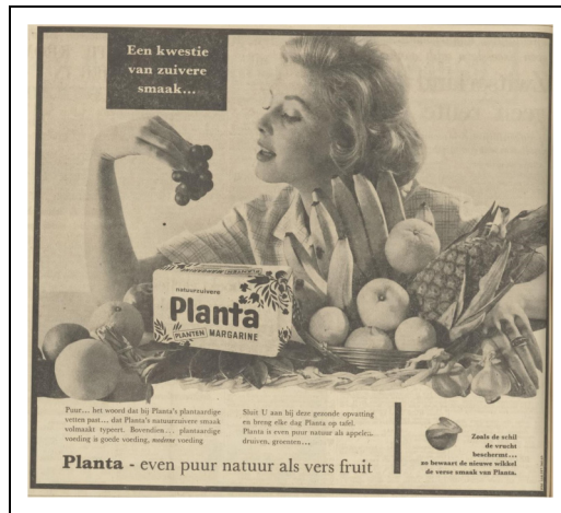
Figure 1. An advertisement for Planta margarine in Algemeen Dagblad , 17 August 1960, six days before it was recalled. The text of the ad stresses the product's 'purity'.

If one wants to use the spraying can in the kitchen, make sure all leftovers are covered or out of reach', the organisation advised. 30