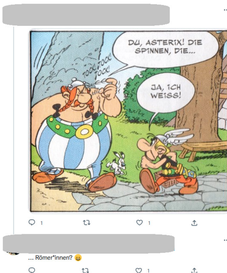
Figure 1: Humorous tweets from opponents and proponents of gender-fair language.

An opponent of gender-fair language made the implicit suggestion that proponents of gender-fair language are crazy (see section 4.3.1. below for more excessive versions of this pattern) using a panel from the comic Asterix. A proponent reacted just as humorously by suggesting the insertion of a gender-fair form into the quote.