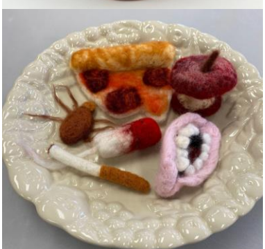
Trashy Beauty, Felted wool and ceramic bowl, 2021. 10" x 5" x 2"