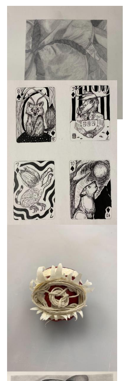
Touched, Graphite on paper, 2020. 10" x 10"