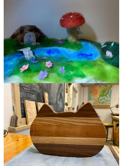
El Gato, Cut and glued wood, 2022. 10" x 8" x 2"