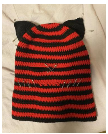
Masked, Yarn and safety pins, 2023. 11" x 1" x 8"