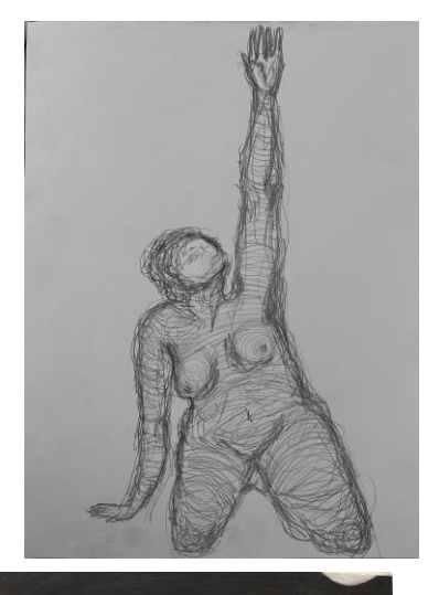
Spirals, Graphite on paper, 2021. 18" x 24"