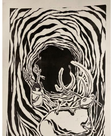
Escaped Reality, Relief print, 2021. 18" x 24"