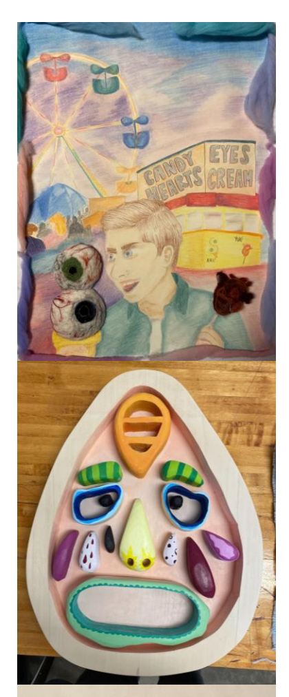
Eat Your Heart Out, Felted wool and paper, 2021. 18" x 24"