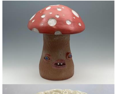
Amanita, Terracotta clay and glaze, 2022. 10" x 13" x 8"