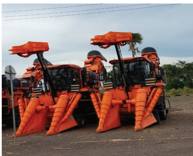
Fig. 3. Mechanical sugarcane harvester.