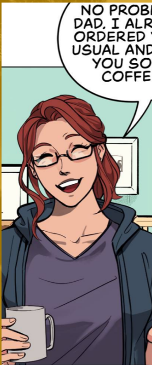
BARBARA GORDON. A.K.A. ORACLE. LIBRARIAN BY DAY, VIGILANTE BY NIGHT.