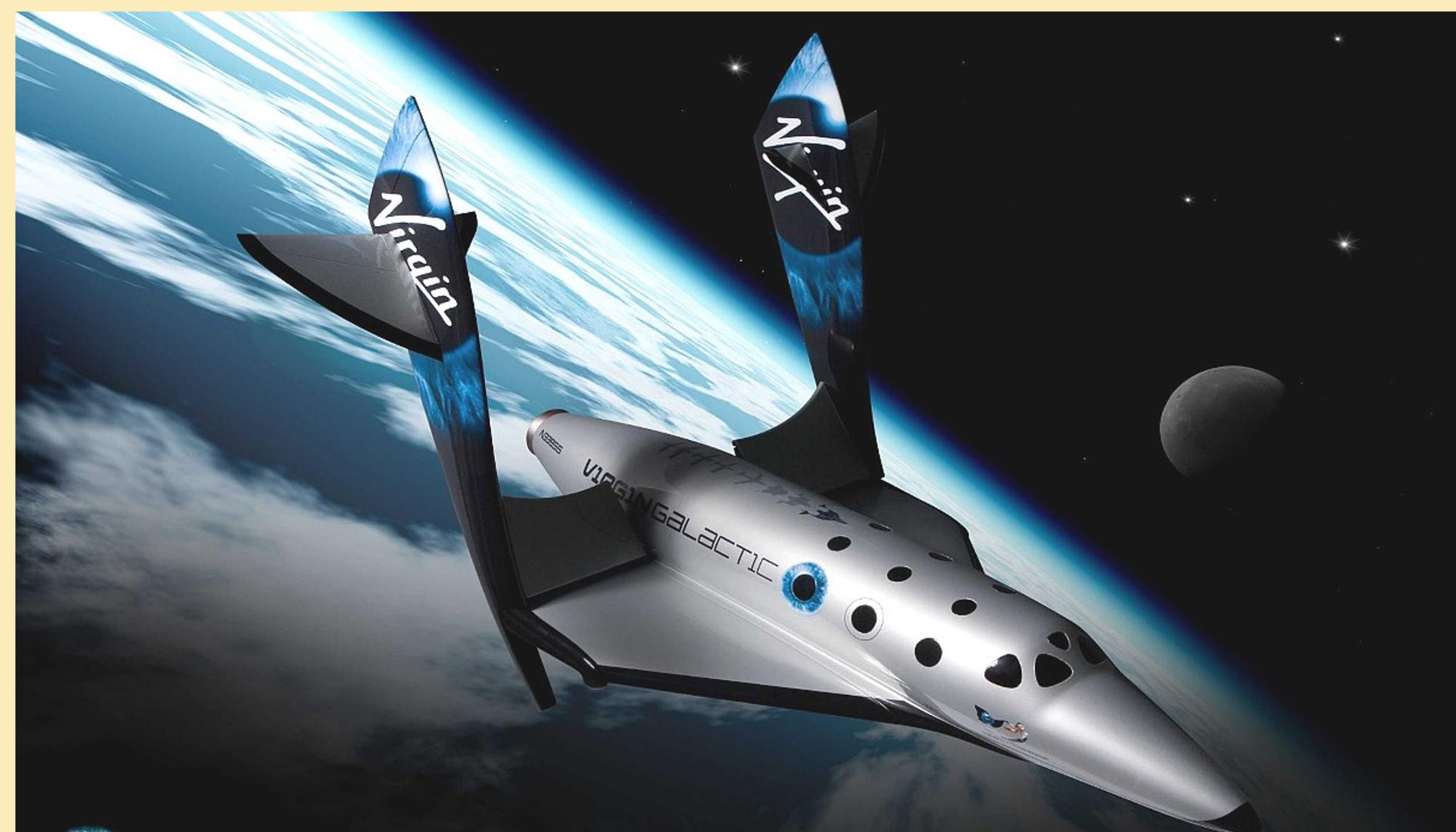
Virgin Galactic 2021