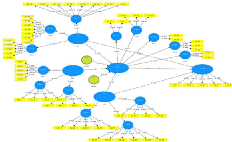
Table 2 Path Analysis Coefficient