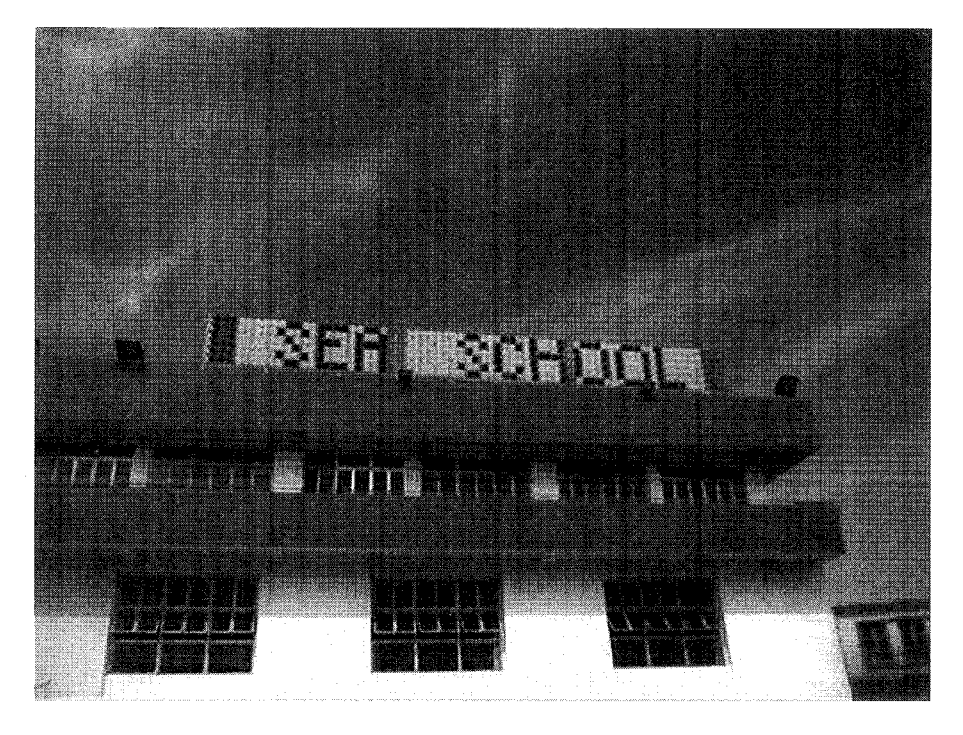
Figure 2: Commercial Demonstration of Micro-Wind Turbines at the Hong Kong Sea School<sup>43</sup>

40. See De La Ree Project, supra note 7; Cavanaugh, supra note 16.