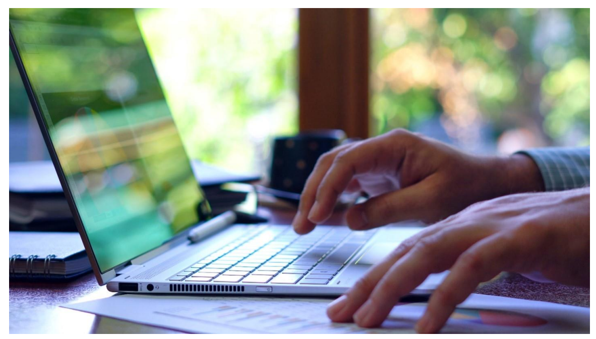
PLEASE JOIN THIS IMPORTANT STUDY ON VIRTUAL LEARNING IN EDUCATION

I am a doctoral student researching virtual classes for students in intensive reading classes. If you are/were the parent or a teacher of a middle school student enrolled in virtual intensive reading classes in the Southeastern United States, this is an excellent opportunity to share your experiences in virtual teaching and/or learning.