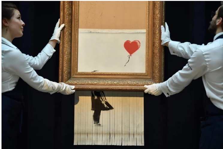
Banksy's famous self-destructing painting, "Love is in the Bin," hanging in Sotheby's, London. 29

art's "true audience is measured in the billions." 27 Even with these positive developments, the art form's historic association with vandalism is partially why many graffiti artists choose to stay anonymous, and "the very illegality of graffiti-making that forced it into the shadows also added to its intrigue and growing base of followers." 28