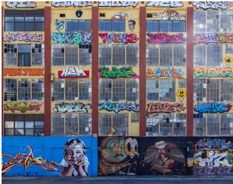
5Pointz prior to the destruction, 188