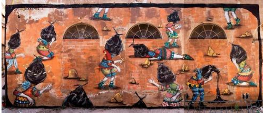
Mural in Barcelona, Spain by Skount 15

1970s. 8 Street art also served, and continues to serve, as a vital means to engage in political discourse globally. A famous example is the Berlin Wall's west side, "a symbolic target for politically motivated art," which still stands today. 9 Even President Roosevelt hired muralists "to represent social ideals" in San Francisco. 10 The trend is not merely incidental; street art is a global mechanism for commentary on political crises, 11 harmful social norms, 12 racism, 13 and to condemn war and violence. 14