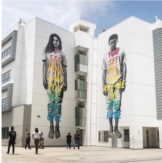
Mural by Cyrcle in Los Angeles, California. 117

Graffiti fits well into the distributive justice framework in three ways. First, street art helps to uplift the public's access to art, especially for those unable to pay admission fees typical of art museums and galleries. 118 Moreover, “[i]t doesn’t need the credibility of any third party for thousands of people to see it every day.” 119 One scholar adds that street art operates to promote greater understanding amongst different social groups. 120 Street artist Vhils believes “that art in general can contribute to create a better environment for people and its communities . . . . Since you often tend to work in the most neglected areas of the city, you become aware of what surrounds you. Street art has always been about confronting these realities.” 121