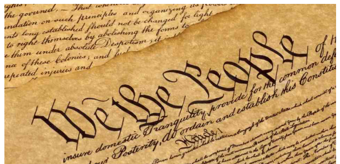
THE SUPREME COURT