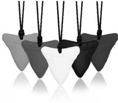
Fig 2 (Chew Necklace)