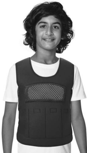
Fig. 1 (Weighted Vest)