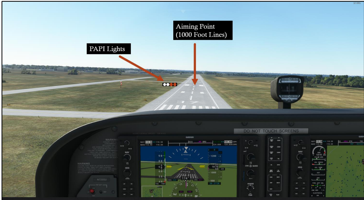
Figure 1. Added image to the orientation presentation. This image depicts the aircraft on a short final to land (Pearce, 2022) Microsoft Flight Simulator 2020

the aircraft’s control yoke (the yoke changes the angle of bank—the yoke is returned to center once the desired bank is achieved), shown in figure 2.