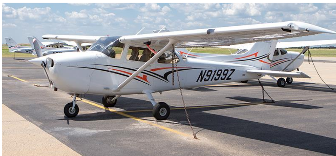
Figure 3. C-172 G1000 aircraft used in the flight portion. Exact aircraft differed

Immediately following the third simulator session, the PI and RA would take the STD to the airplane, where the STD would perform three landings at KSWO. During the actual flight, the PI was in the front seat aiding the STD and providing instruction, while the RA remained in the rear seat to observe the STD and focus “outside the aircraft” listening to Air Traffic Control and watching for other aircraft traffic. The RA functioned as an additional situational awareness safety barrier to the flight – and was able to on multiple occasions apprise the PI of ATC radio communications requiring action. The allowed the PI to focus inside the aircraft and with the STD. The PI performed a single demonstration lap of the traffic pattern before handing the control of the aircraft to the STD. At all times, the PI could provide assistance up to and including resuming control of the aircraft. Figure 3 is an exemplar of the fleet aircraft used for flight.