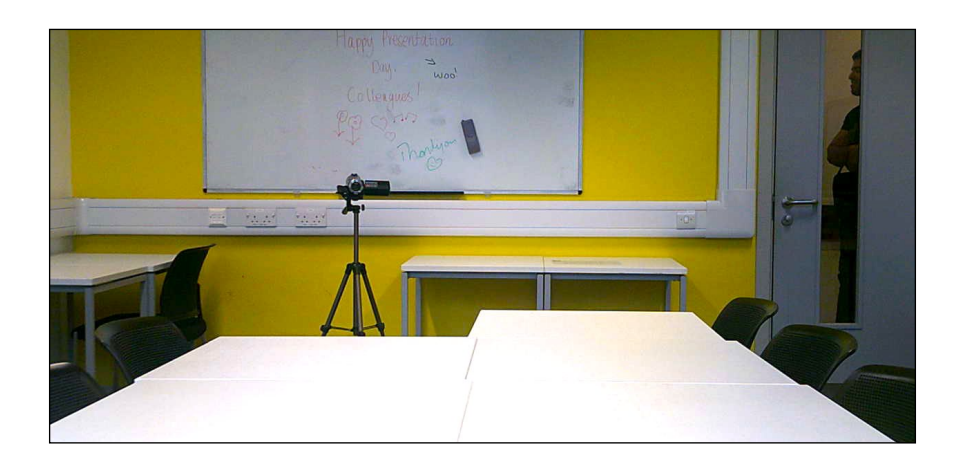
Figure 4.1: The standard arrangement of recording equipment in a private PBL room.

Participants were video-recorded during PBL sessions at the same time as the rest of the student groups undertaking the chemical engineering-based module. Whereas the other PBL groups were based within a large university hall, however, the video-recorded groups were provided with their own private rooms (see figure 4.1, below) with the aim of maximising the quality of the data to be collected.