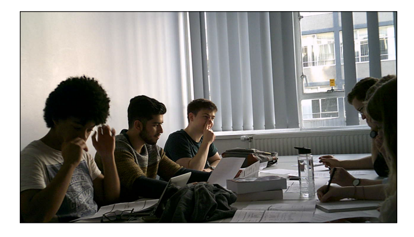
Figure 4.2: Group 6 shown in the typical PBL session.

The third round of data collection involved two student groups who were recruited in the same fashion as above, but had previously been assigned to these groups through the class leader's use of Belbin's (2010) self-perception inventory, rather than being randomly assembled. The two groups each received 19 sessions of PBL (38 in total), and produced 43.5 hours of video-recordings (the largest amount yielded by any of the four phases of data collection) during the period of September - November 2017. There were considerable variances in the timetabling of the sessions, as summarised above in table 4.1. Nick - of group 6 (of whom are pictured in figure 4.2) - was a chemistry, rather than a chemical engineering, student.