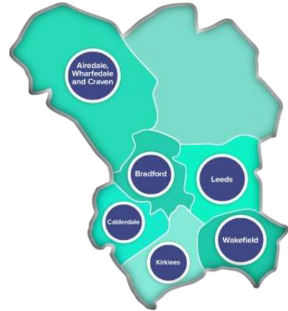
Figure 1. Map of West Yorkshire regions

The team spent two years undertaking: Literature reviews, system and pathways evaluation, routine health data analyses, surveys with healthcare professionals and qualitative interviews with voluntary sector workers and women from ethnic minority and socio-economically deprived backgrounds to provide in-depth insights on the causes of these inequalities. These findings were taken to expert panels of healthcare practitioners, managers and commissioners to develop the recommendations.