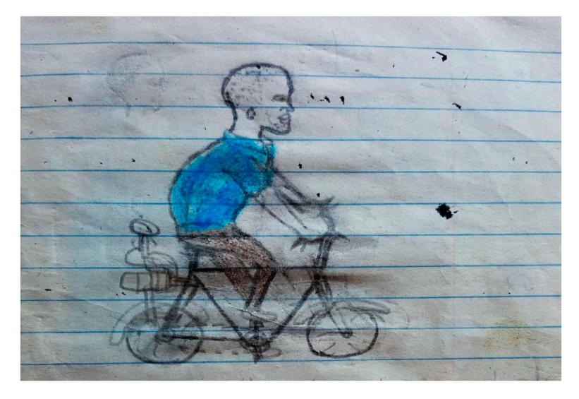
Figure 1. A grandfather taking his granddaughter to a health centre on a bicycle. Drawing by Orlando, granddaughter, 13 years

grandchildren to a health centre, using their bicycles or kabaza (bicycle taxis), as explained below: