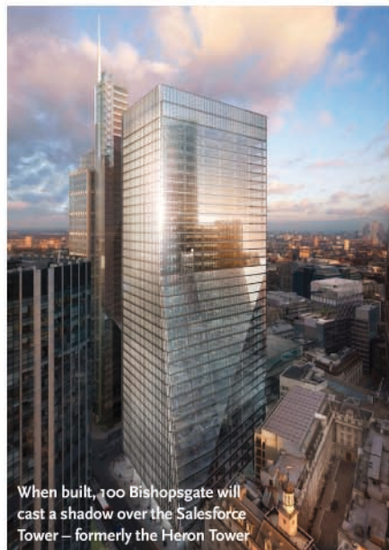
When built, 100 Bishopsgate will cast a shadow over the Salesforce Tower – formerly the Heron Tower

Recognising this, a joint project between University College Dublin and De Montfort University has been proposed systematically to test the positive and negative impacts of buildings in their urban setting. The project will not only evaluate the effects of the urban setting on the proposed building design, but also the effect of the proposed building on its surroundings.