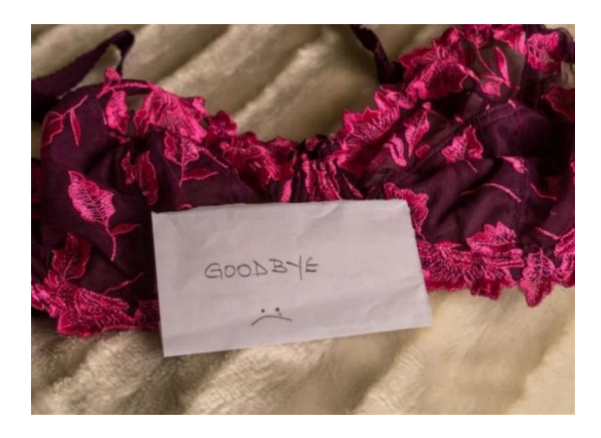
\begin{tabular}{ll} \textbf{Figure 3.} Saying goodbye to the glamorous stuff (Leah). @ Leah (a pseudonym). Reuse not permitted. \\ \end{tabular}

The final theme, adapting to breast or trunk lymphoedema , encompasses women's experiences of developing expertise and an ability to accommodate the condition both practically and psychologically. All participants spoke about the challenge of obtaining suitable bras: frequently they were too tight