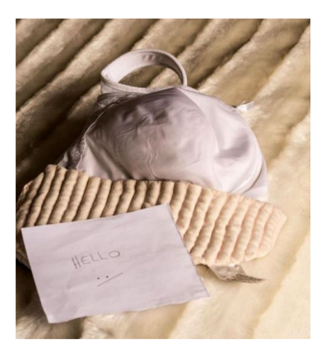
Figure 4. Saying hello to this horrible thing (Leah).