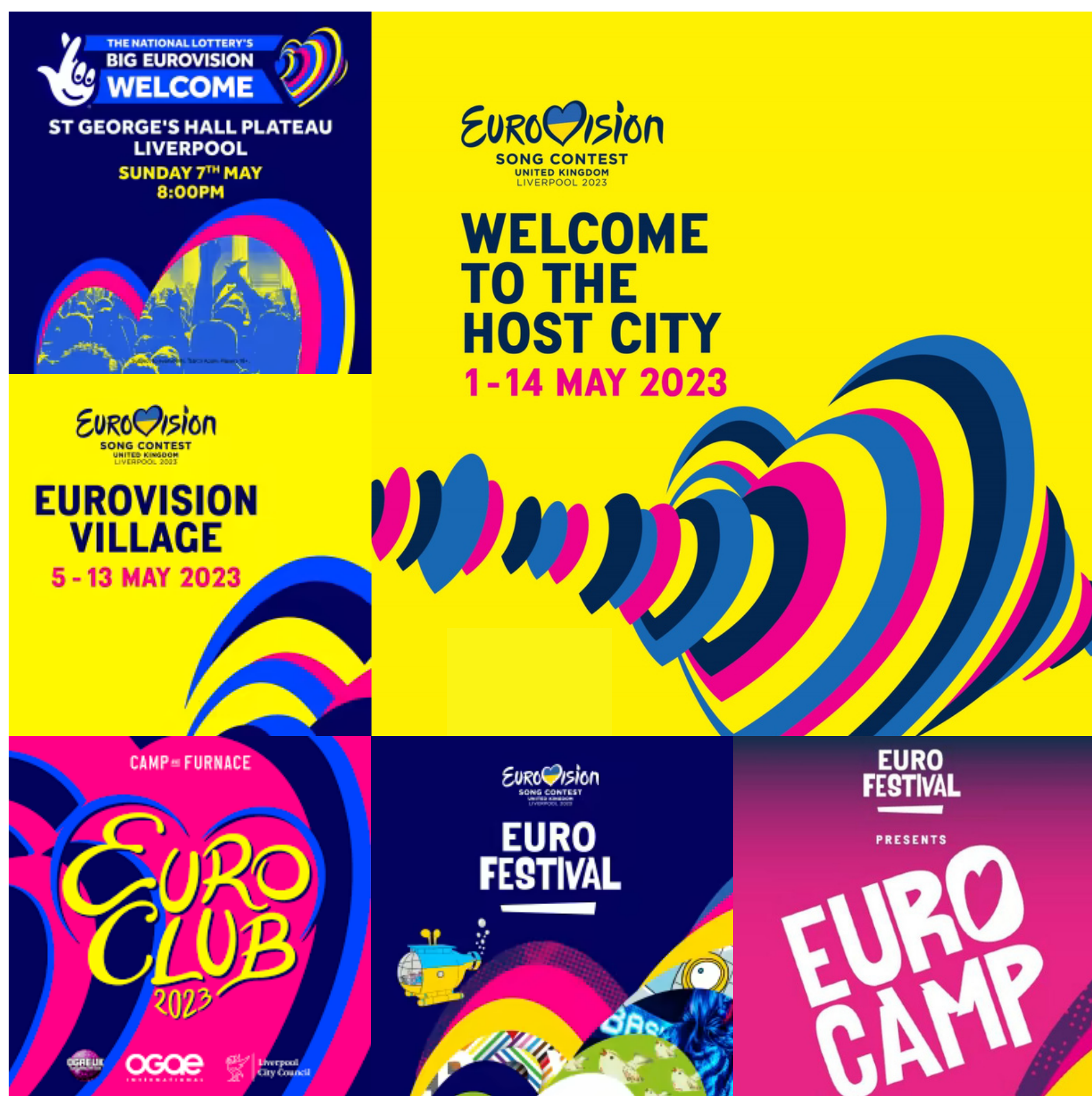
Figure 1. Liverpool Eurovision 2023 events

With over 12,000 accredited staff involved in the planning and delivery of Eurovision, it is the largest and most complex multi-agency (MA) event that Liverpool has ever hosted.