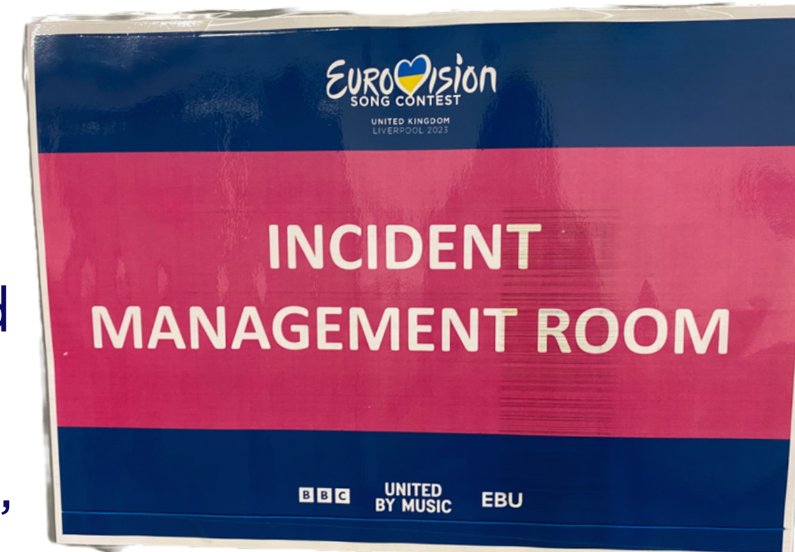
Figure 2. Incident Management Room, M&S Bank Arena