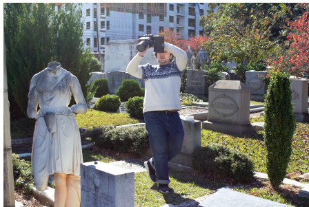
Fig. 1. GSU student using a Red Camera to experiment with photogrammetry.

Historic Oakland Cemetery is one of Atlanta's oldest burial spaces and public parks. Working with the Historic Oakland Foundation, Georgia State University, Emory University, and Beam Imagination are creating an experimental, collaborative, and public-facing digital archiving project that combines maps, a burial database, 3D visualizations, and data curation. The project is an example of what Ed Ayers has called generative scholarship , as it is “built to generate, as it is used , new questions, evidence, conclusions, and audiences” and “offers scholarly interpretation in multiple forms as it is being built”[1]. The project will serve as a platform for connecting community storytelling, experiential learning and research projects at K-12 and higher education institutions, game development, walking tours, and archaeological findings.