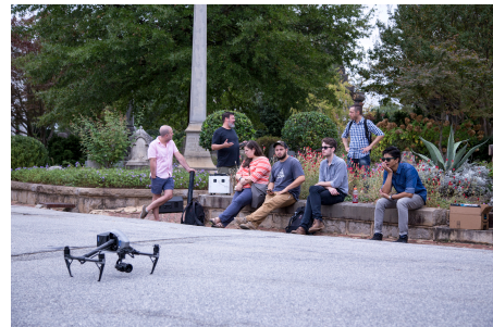
Fig. 2. GSU and Emory faculty and students working with Beam to create drone map.