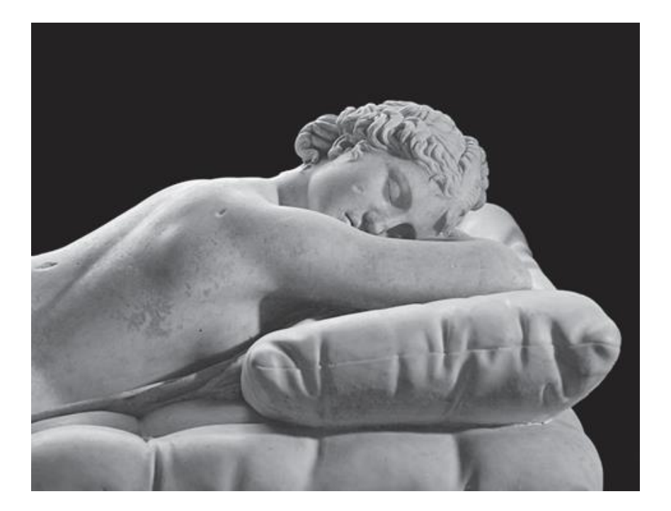
Figure 5.4: Sleeping Hermaphroditus Front view (detail). Carved marble. Louvre, Paris (Inv. MR 220).

When I first saw images of the Louvre's copy of Sleeping Hermaphroditus , I found myself most drawn to their peaceful expression (Fig. 5.4) and unbothered body language. It seems evident that they lived a life without threat to their non-traditional existence. Bernini's delicately voluminous mattress and pillow contour to the figure so effortlessly that it is easy to question if they are actually carved from marble. It left me contemplating the creation of personalized objects intended to cradle their owner.