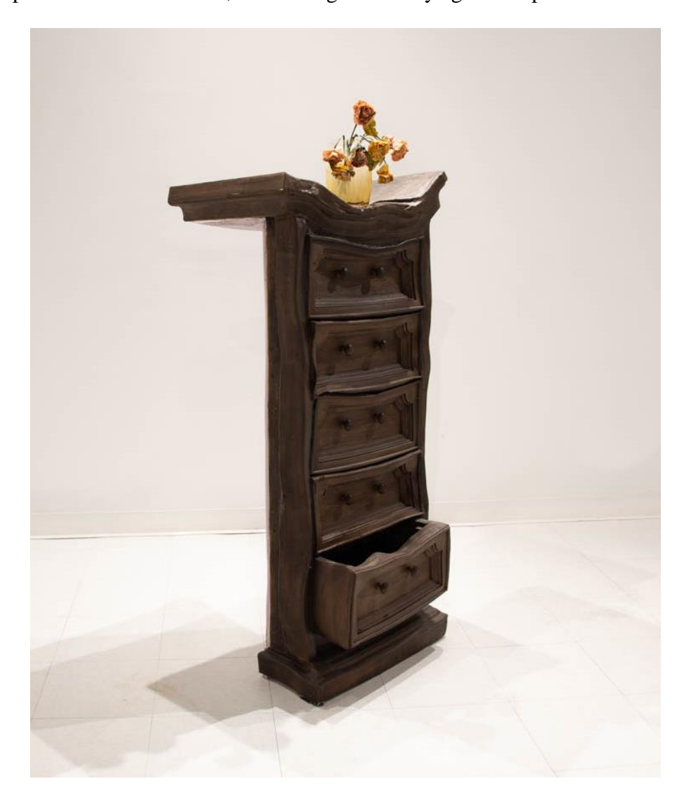
Figure 5.2: Katie Kearns. Weight on My Chest (of Drawers). Aqua Resin, foam, wood, found glass vase, crepe paper, wire, paint. 58 x 18 x 18 inches. 2022.

relationships, romantic or otherwise, can have on us. I found it important that the structure still retain a sense of composure, not to deny the emotions of heartbreak, but rather to demonstrate that even in our softest moments we can have the strength to work through it. Each unsuccessful relationship I have come out on the other side of has shown me that I still hold all of the elements necessary to flourish. As you approach the dresser you are able to peek into the bottom drawer, left partly opened. Full of fresh soil, it encourages us to try again. To plant a new seed.