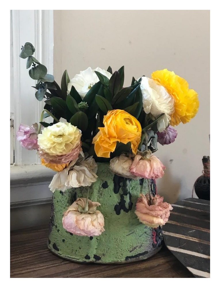
Figure 5.1: Bouquet of dying flowers.

me the ways in which my ex and I were incompatible, but she still held some of my fondest Baton Rouge memories. She was my biggest support and confidant my first two years of grad school. Missing someone and knowing you're not right for each other isn't mutually exclusive.