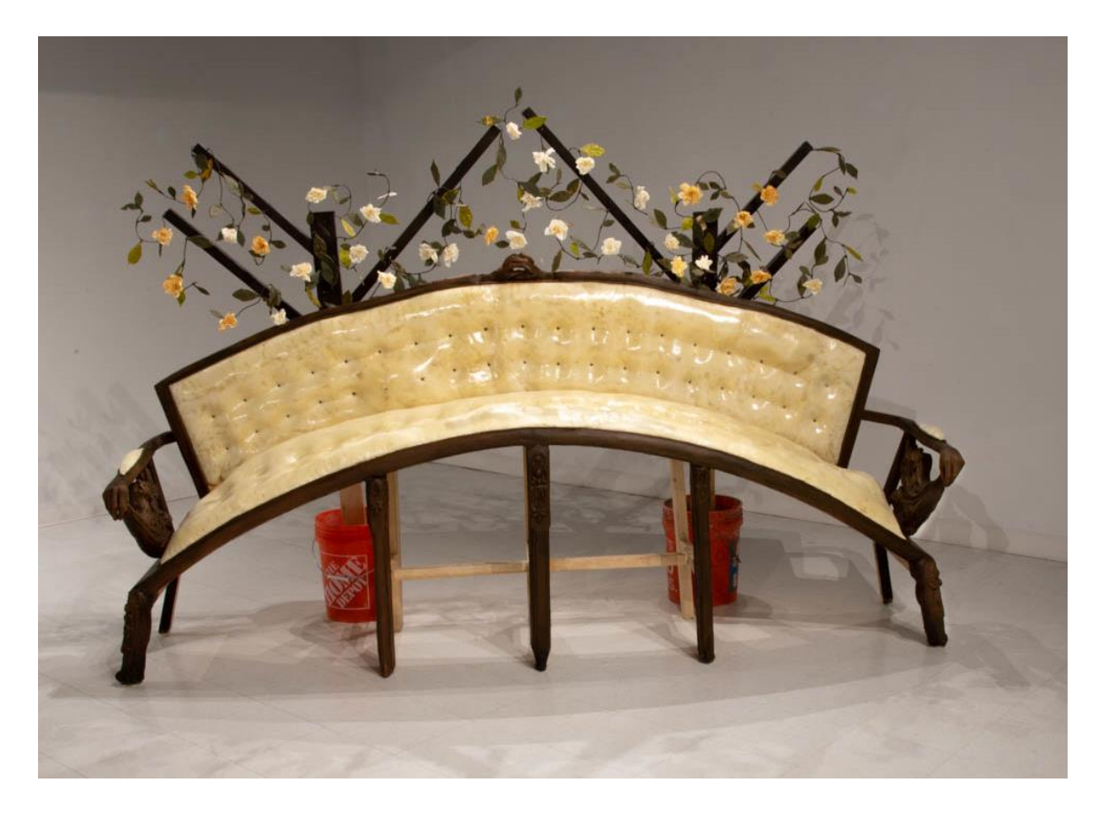
Figure 6.1 : Katie Kearns, Rollercoaster of Love(seat) . Foam, wood, Aqua Resin, Apoxie Sculpt, paint. 108 x 52 x 24 inches. 2023.