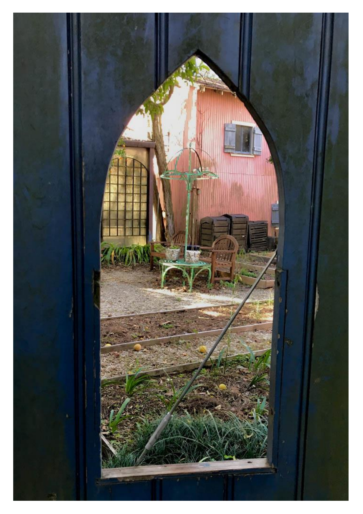
Figure 3.3: View from the entrance of the "Secret Garden". Baton Rouge, LA. 2020.