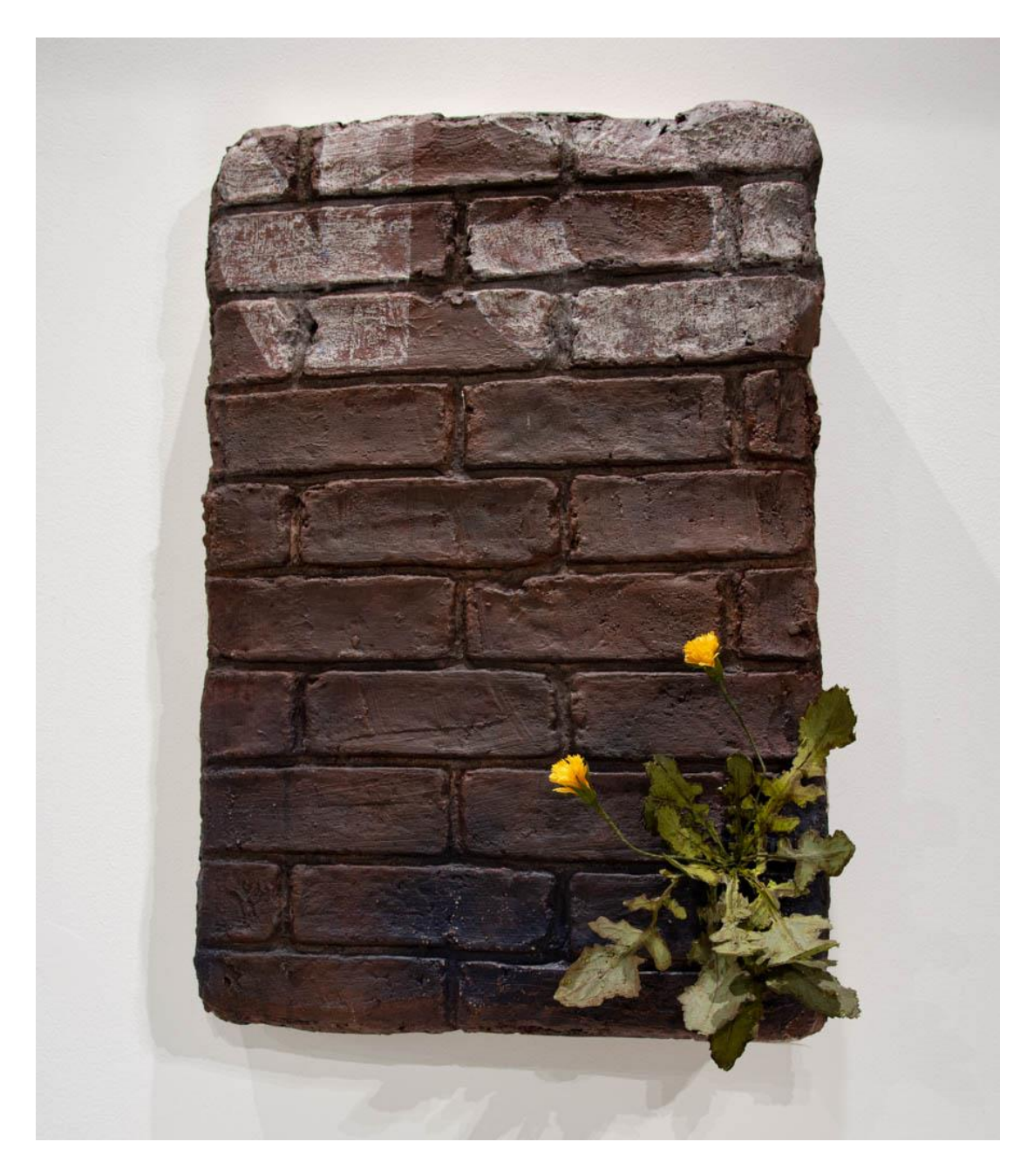
Figure 3.4: Katie Kearns. Brick by Brick Aqua Resin, foam, wood, hot glue, crepe paper, wire, paint. 28 x 24 x 8 inches. 2023.

The elevation of the wall is insinuated by the presence of a faded ghost sign, which is typically placed several feet up the wall for optimal visibility, yet the dandelion has still managed to find its way to exist at such great heights. At first glance the brick looks real, but as you travel around to the right side you see it is lifted from the flat surface to reveal layers of wood, foam,