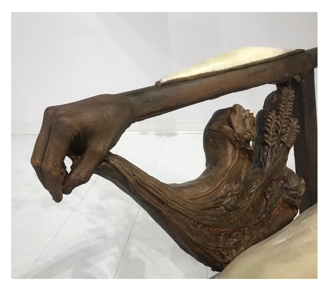
Figure 6.2: Katie Kearns, Rollercoaster of Love(seat), detail.

Accompanying the loveseat is an elongated representation of the gardenia bush that lay perfectly framed within the large picture window of my living room. The fragrant flowers have many times brought me a sense of serenity or hope as I navigated the hardships of COVID and grad school. It has been a privilege to be able to observe their immense growth from the comfort of my living room. Tell Me You Love Me (Fig.6.3) was designed to yet again balance elements of construction with realism, this time as an implication to the duality of gender, and how one can find equilibrium between the tough and delicate aspects of our personalities. Pulling from the symbolism of Victorian era as nod to the couches that inspired Rollercoaster of Love(seat) , in a