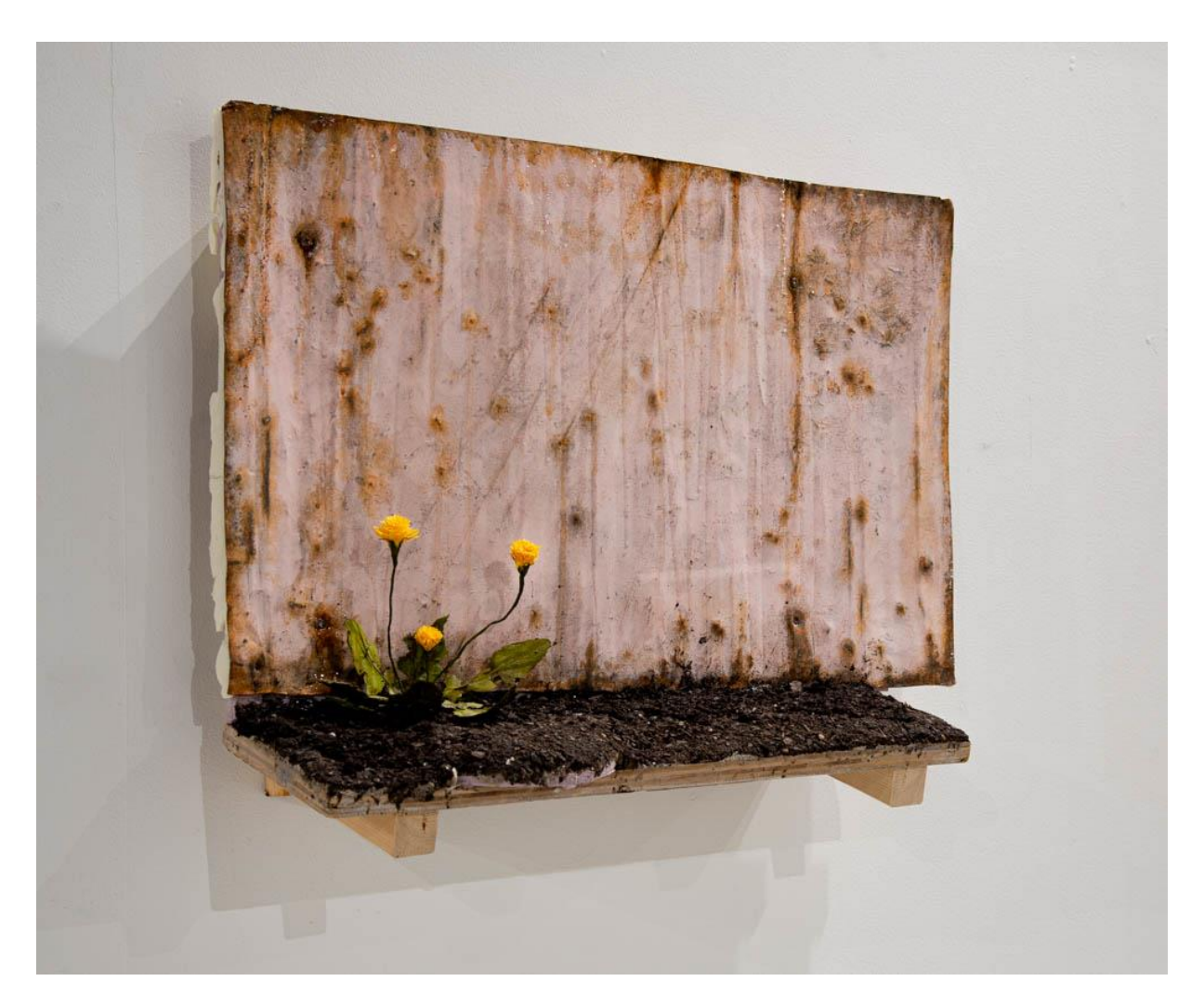
Figure 3.2: Katie Kearns, I Gotta Send My Love Down to Baton Rouge Corrugated steel panel, wood, foam, soil, resin, hot glue, crepe paper, wire, paint. 27 x 12 x 6 inches. 2023.