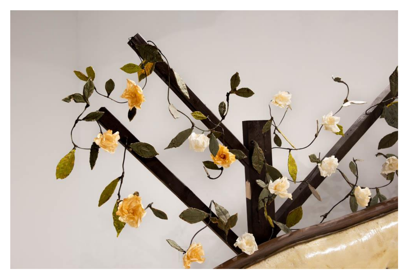
Figure 6.3: Katie Kearns, Tell Me You Love Me , detail. Wood, Aqua Resin, Cement, Home Depot Buckets, Hot Glue, Crepe Paper, Wire, Paint. 96 x 65 x 12 inches. 2023.

secret admiration. In queer romance, secrecy can often be used as protection, either from the discrimination, or to save from embarrassment if the sexuality of your crush could potentially not lean in your favor. Whichever your association with the flower, the piece is intended to entice the viewer with subtle fragrances and convincingly real paper flowers, giving them the chance to stop and appreciate the beauty of life.