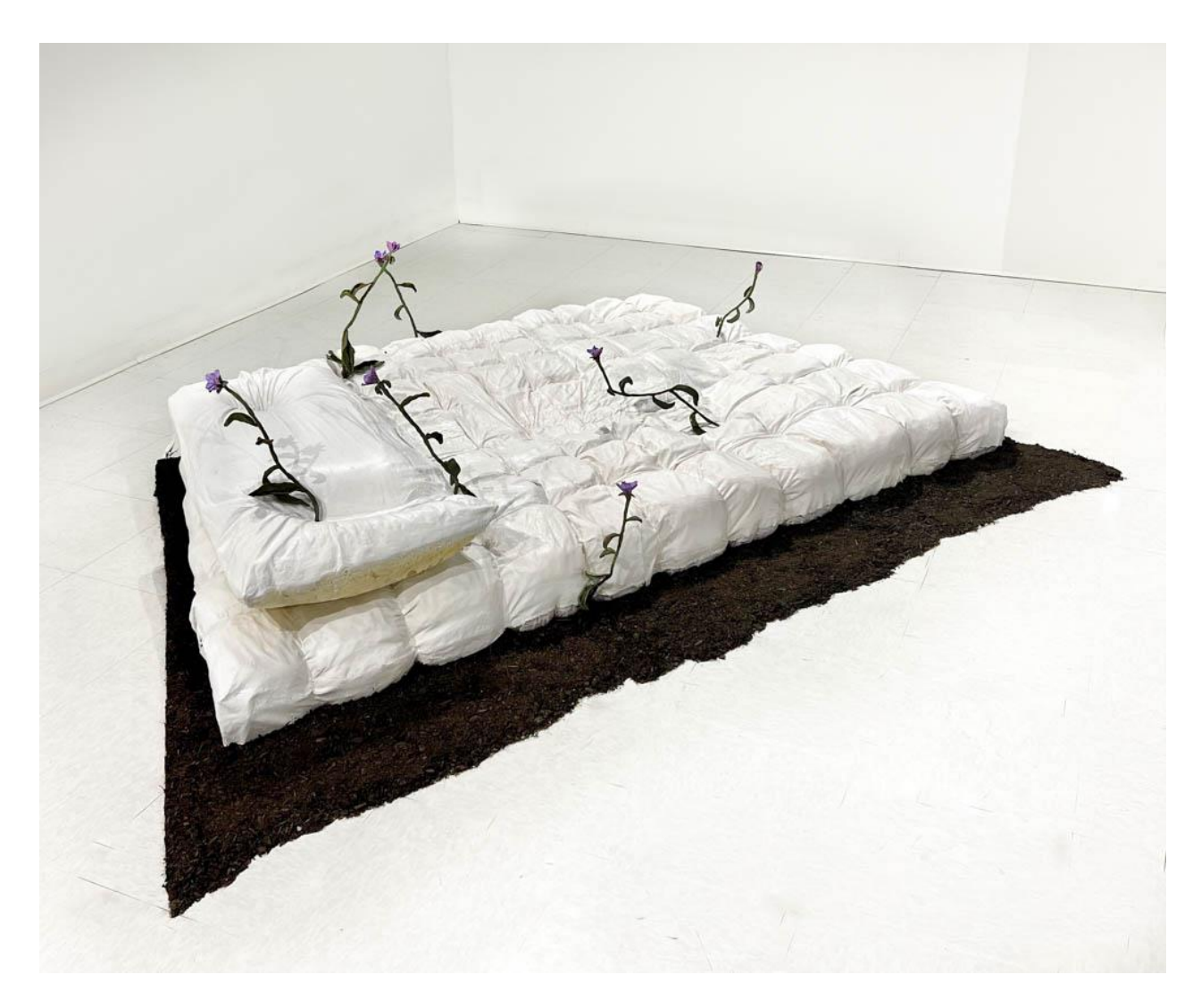
Figure 5.5: Katie Kearns, Sleeping Enby/(Solanum Plastisexum) . Aqua Resin, foam, fabric, Apoxie Sculpt, Crepe Paper, Wire, Paint, Soil. 75 x 55 x 18 inches. 2023.

The multiple flowering Solanum sprouting from a bed designed for humans (or mythical beings) become a representation of sexual diversity throughout the entirety of natural life. If one can understand the multitudes of identity and function for a plant, it shouldn't be so difficult to imagine for humans as well. The mattress, which rests atop a bed of soil, proves the importance of a supportive environment to the development of all species, despite the complexity of personal needs. The piece as a whole emits a sense of calm, much like laying in a quiet garden bed,