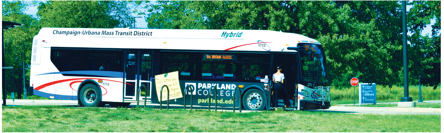
"The Champaign-Urbana Mass Transit District circulating the community in and out of Parkland's Campus."

for Parkland students to have resources of information available in case such an occasion were to arise. Many students were unaware the college had a designated tornado shelter and many more who were not present during the event on Tuesday are still uninformed. If you have questions regarding natural disaster or public safety emergencies on campus, we would encourage you to confirm you are receiving Parkland's emergency alerts and contact public safety with your concerns.