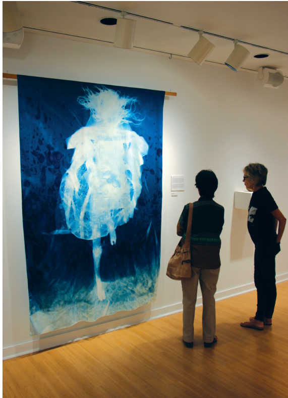
Stacey Gross, "Ukiagaru," cyanotype, 2019