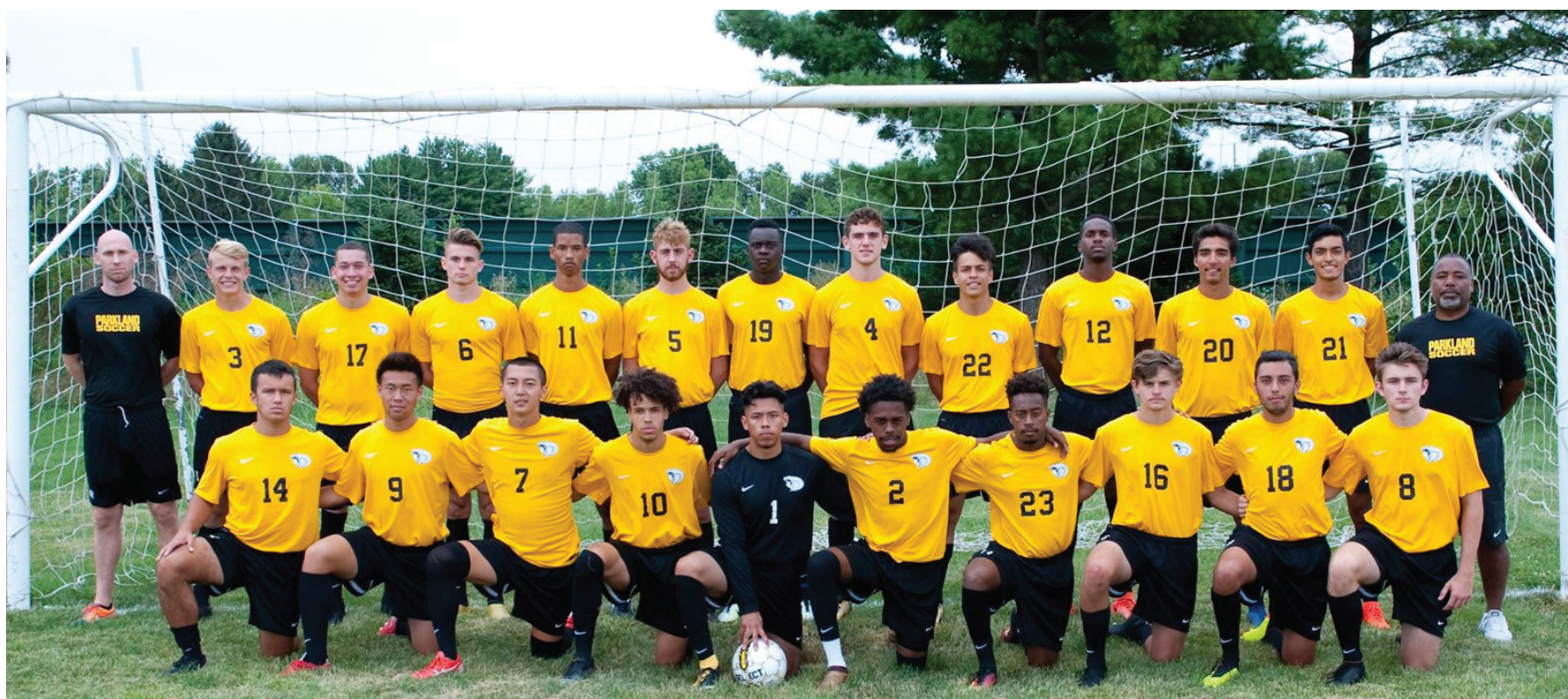
Parkland College men's soccer team.