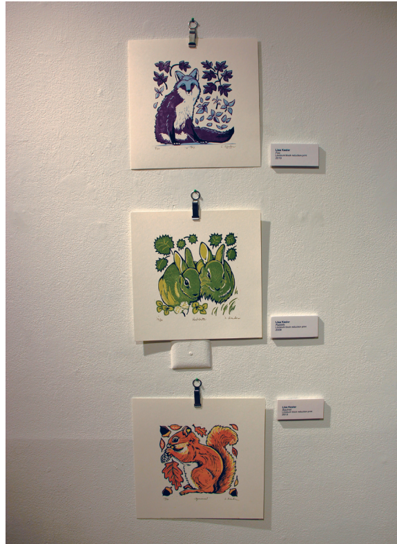
Lisa Kessler: Top: "Fox" Linoleum block reduction print, 2019, Middle: "Rabbits," Linoleum block reduction print, 2019, Below: "Squirrel," Linoleum block reduction print, 2019