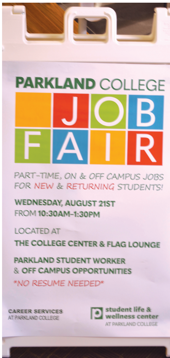
The Job Fair sign provided information to job seekers.