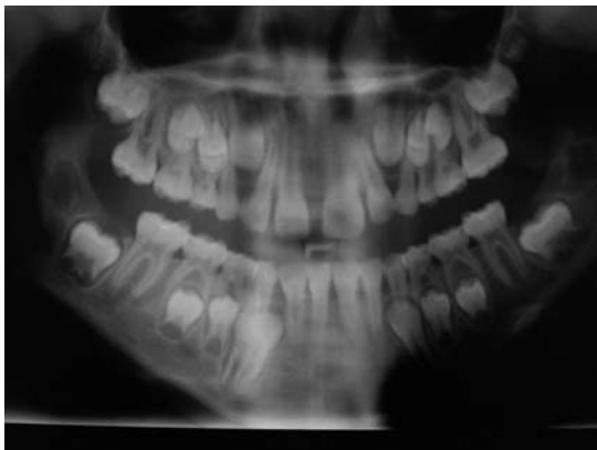
Fig. 3. Case 2. Panoramic X-ray view showing taurodontism affecting 2.6 and 1.6, with root anomalies of unerupted 4.3. This patient presents no supernumerary teeth.

Periodontal treatment was provided, and the need for orthodontic management was evaluated but rejected by the parents.