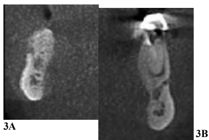
Fig. 3A and 3B. The cross-section images of patient's right and left mandible.

nal cross-sectional cuts perpendicular to the alveolar ridge were performed with cone beam computed tomography (trademark: Newtom Flat Panel) and confirmed this suspicion.