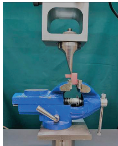
Fig. 2: Mean shear bond strength values (MPa) for all groups.

The mean and standard deviation (SD) of the SBS values and p -values are listed in Table 2. Kruskal-wallis