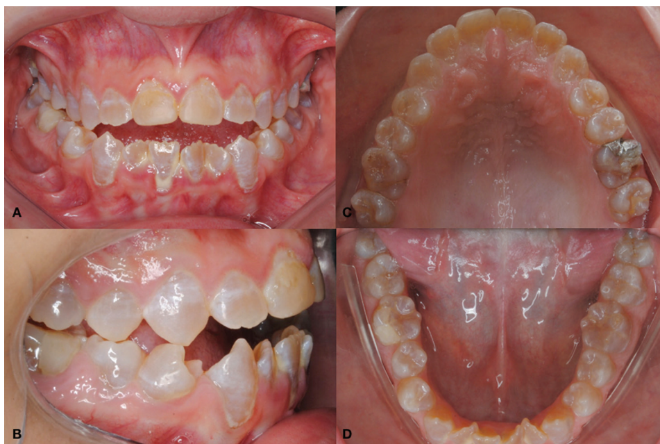
Fig. 1: Intra oral clinical examination. A: Anterior open bite and brownish teeth. B: Angle Class III and posterior crossbite. C: tooth 26 with amalgam restoration crack. D: anterior teeth presenting crowding and dental calculus.

The more severe the osteogenesis imperfect, more severe the Angle class III malocclusions, anterior open bite, crossbite posterior and mandibular prognathism that may be related to a lack of antero-inferior displacement