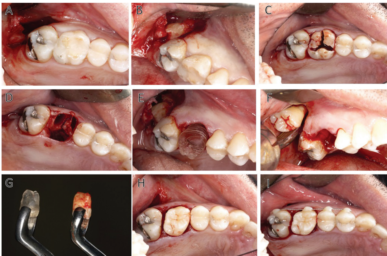
Fig. 2: A-I: Step-by-step of surgical procedure.

A syndesmotomy of the soft tissues and periodontal ligament around tooth 2.6 was performed. The exodontia was completed with odontosection, luxation and