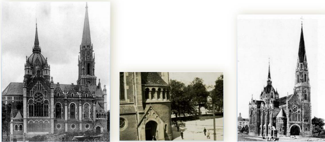
Figure 1. Archival photos of the Parochial Cathedral of St. Mary of the Perpetual Assistance

points, texturing. It should be noted that the model built using this method allows you to reproduce only the appearance of the object.