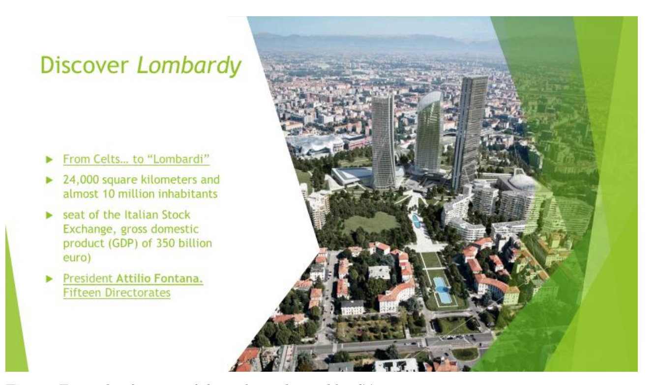
Fig. 8: Example of a page of the website devised by GA

Saggi/Essays Issue 21 – Spring/Summer 2023