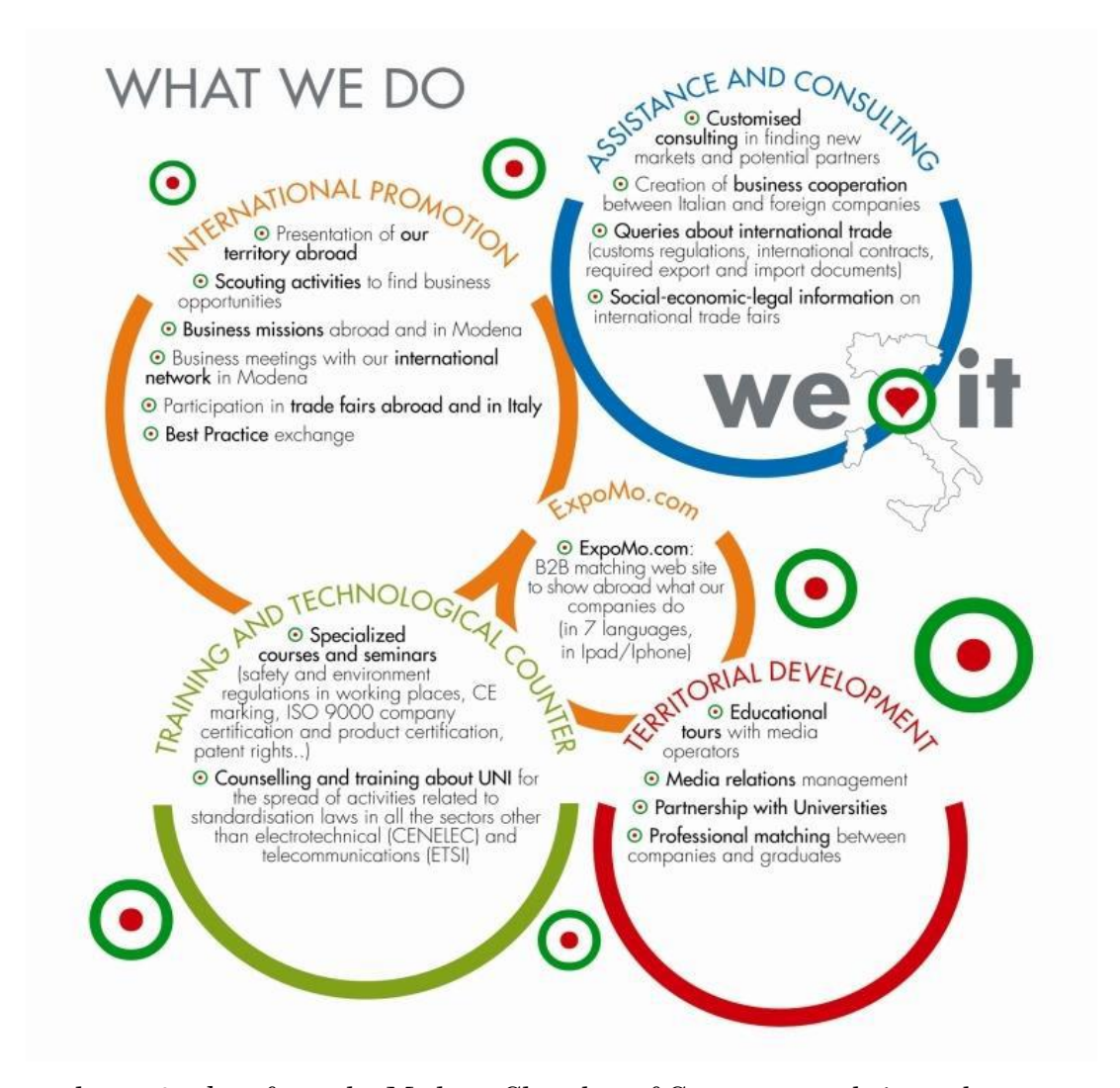
Fig. 3: Example no. 6 taken from the Modena Chamber of Commerce website-to-be

ETSI;9 B2B<sup>10,</sup> and one acronym which only enjoys local currency, UNI.<sup>11</sup>