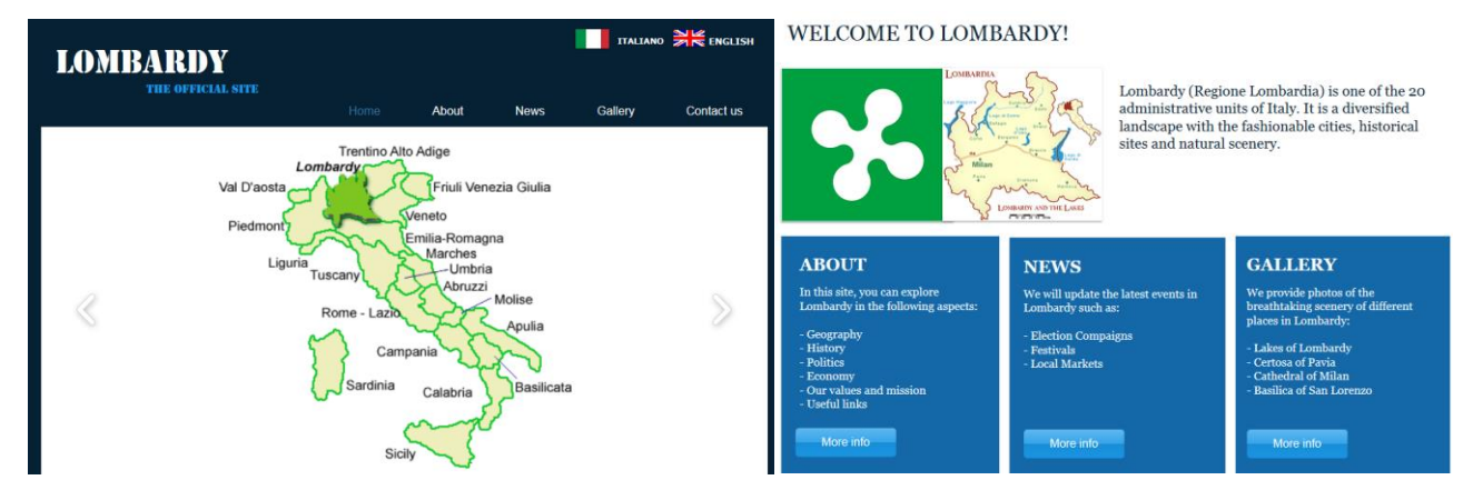
Fig. 6: Example of the opening page of the website devised by DC14

Later, the students themselves were asked to develop their own versions of the original text and some of them created a new website, in which they tried to exploit the affordances of the web, such as active links on which to click to obtain additional information, dropdown menus, etc.