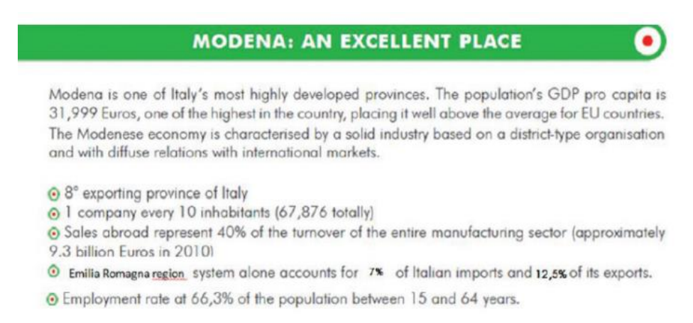
Fig. 5: Example no. 8 taken from the Modena Chamber of Commerce website-to-be

The influence of the local culture is also to be seen in the following example (8) where the word province is mentioned. In Italy a provincia is an administrative division of intermediate level between a municipality (comune) and a regione. But the general meaning that can be retrieved from a dictionary reads as follows: "one of the principal administrative divisions of a country or empire." 12