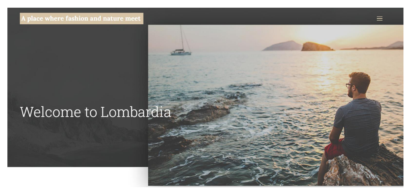
Fig. 9: Example of the opening page of the website devised by AH16

On this website all the necessary information is illustrated, just click!