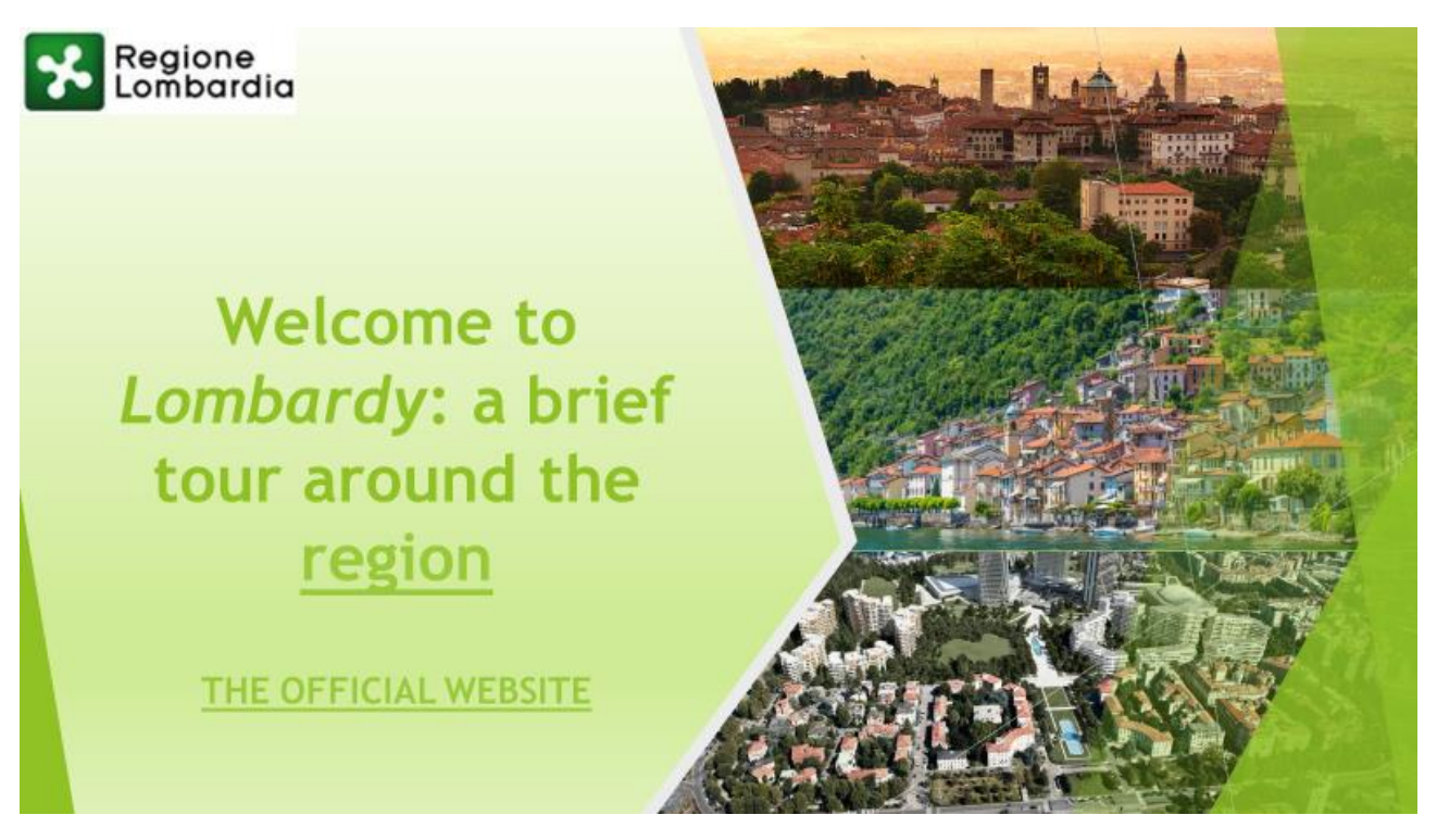
Fig. 7: Example of the opening page of the website devised by GA15