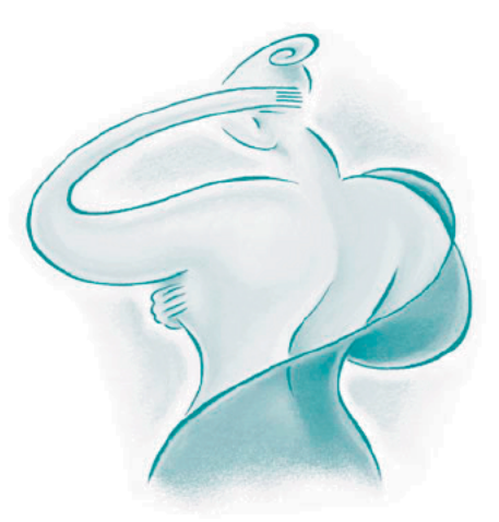
Women should be familiar with the look and feel of their breasts—and there's no right or wrong way to do that.

For premenopausal women (women still having periods), the ideal time to touch the breasts is usually right after a menstrual period. After a woman's period, hormone levels are lower, making breast tissue softer and less tender and making changes easier to feel.